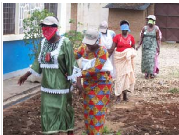
Participants learn about trust in an exercise in which blindfolded participants are guided by partners.