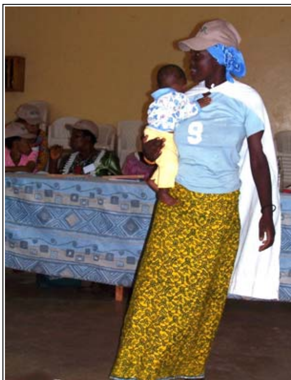
A participant gives a presentation on what it means to be a veteran and a mother.

Burundian women involved in military service were often little more than slaves. 14 Conditions were abysmal for those assigned to cook, wash clothes and act as "bush wives" for male soldiers. Life was only marginally better for women who received combat training and went into battle. Women suffered from hunger and sexual abuse at the whim of their male comrades, and even those who had distinguished themselves in battle garnered little respect and few privileges. 15