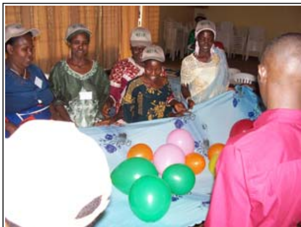
Participants learn how to help others relinquish painful memories by exhaling them into balloons.

on teaching participants to ask questions designed to promote analysis of the survivor's own role in the survival story in order to emphasize self-efficacy and promote self-identification in a positive light. This was crucial for those recovering from feelings of humiliation and guilt, which can plague survivors for years. Questions included, "How did you find the strength to go on?" and "What have you learned about yourself from this experience?" Finally, participants were instructed to encourage the survivor to look toward the future: "What will you need to do to rebuild your life?" 33 Storytelling is an important part of Burundian oral tradition and proved a valuable part of the training.