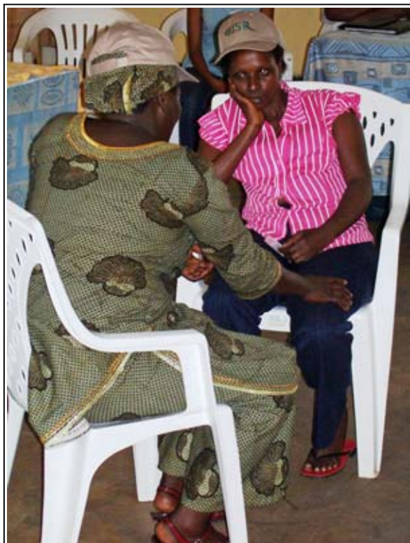
Participants play the roles of a peer-support worker counseling a female veteran in order to practice counseling skills.

A major component of the workshop was role-play exercises in which a "peer-support worker" conversed with a "survivor," giving participants an opportunity to practice peer-support skills and analyze each other's performances. Role-plays gave participants an opportunity to present stories about not only trauma and