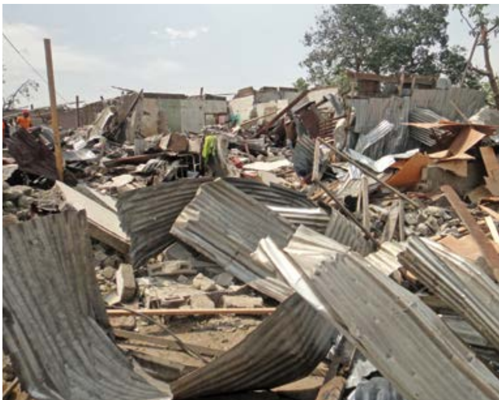
Munitions stored at this tank regiment barracks in Brazzaville, ROC, exploded on 4 March 2012, killing 223 people and injuring 2,500.

The Small Arms Survey found 302 instances of unplanned explosions in 76 countries between January 1998 and October 2011. 2 As a result of such explosions, communities are rendered homeless, and rescue workers fight fires and