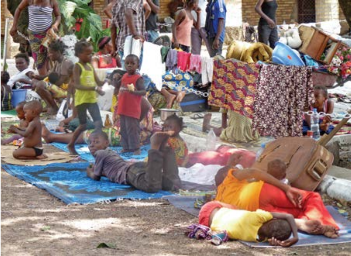
Brazzaville residents camp out on the grounds of a cathedral after they were displaced by a huge explosion at an army barracks in the city.

reprioritize significant costs of reconstruction over multiple years. For example, the Brazzaville explosion destroyed hundreds of homes and businesses, leading to the temporary closure of schools and a hospital. An estimated 5,000 people lost their homes.