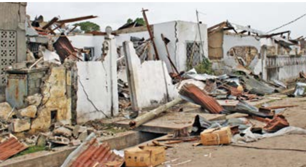
Extensive damage was caused to residential areas of Brazzaville when munitions at an army barracks blew up.

age in “compatibility groups,” with incompatible items (due to their chemical composition or explosive effect) stored separately within a storage site.