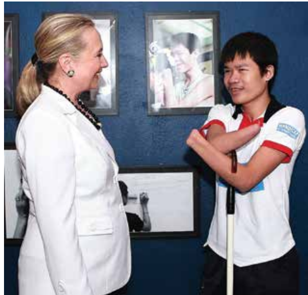
Former Secretary of State Hillary Clinton visits with Phongsavath Souliyalat at COPE Center in Vientiane, Laos, during her July 2012 visit.

Laos signed the Convention on Cluster Munitions (CCM) on 3 December 2008 and ratified the legislation on 8 March 2009. 5 The CCM is especially significant because Article 5 outlines the principles of victim assistance for UXO survivors. These principles are in agreement with the rights guaranteed to disabled people by the Convention on the Rights of Persons with Disabilities (CRPD), which Laos signed on 15 January 2008 and ratified 15 September 2009. 6 For example, that UXO survivors should receive support through medical and rehabilitative care corresponds with their right to the highest obtainable level of health and rehabilitation set forth by the CRPD. The CCM and the CRPD both emphasize social and economic inclusion for survivors. Like the CRPD, which highlights the rights of disabled women and children, the CCM stipulates that victim assistance for UXO survivors should be gender- and age-sensitive. 7,8