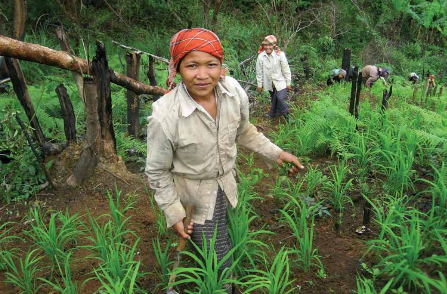
In Laos, rough roads and difficult topography hinder mobility of disabled persons in rural areas.

steps in case of flooding. Similarly, stilts support houses in rural areas and homes generally have steps leading to the front entrance. The country's political history has also affected the architecture of its buildings. Shops in Laos are often very narrow with several floors, because businesses were traditionally taxed on the amount of street frontage their business occupied. 15 Some disabled people with mobility issues cannot access the buildings due to their tight, narrow construction, which prohibits wheelchair ramps and makes other accommodations equally difficult.