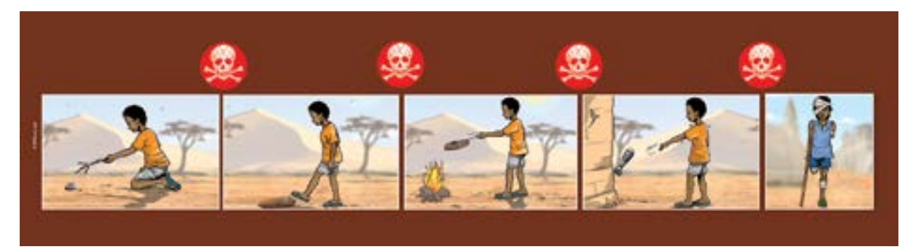
Figure 5. From left to right: Don't poke it! Don't kick it! Don't throw it in the fire! Don't try to break it open! Beware of the results of dangerous behavior!