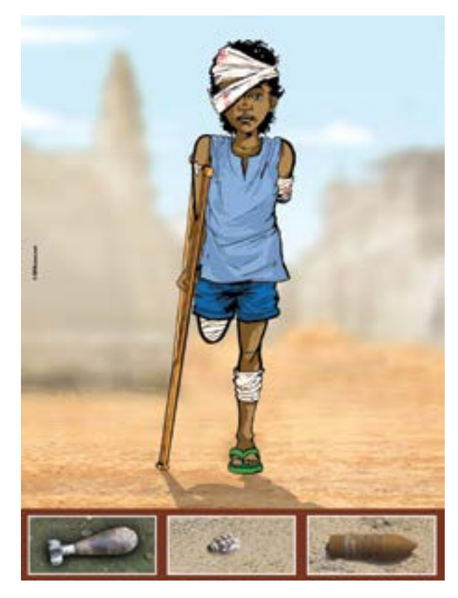
Figure 1. MRE materials: An injured boy—this relates to one of the most serious accidents that occurred prior to the MRE emergency campaign in Mali mid-2012.