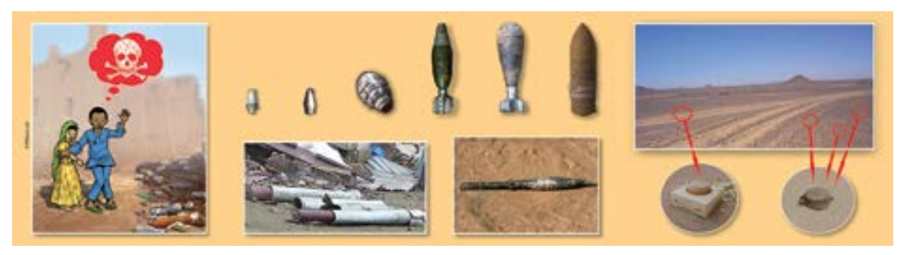
Figure 4. The leaflet portrays more dangerous items including anti-vehicle mines in the north of Mali.