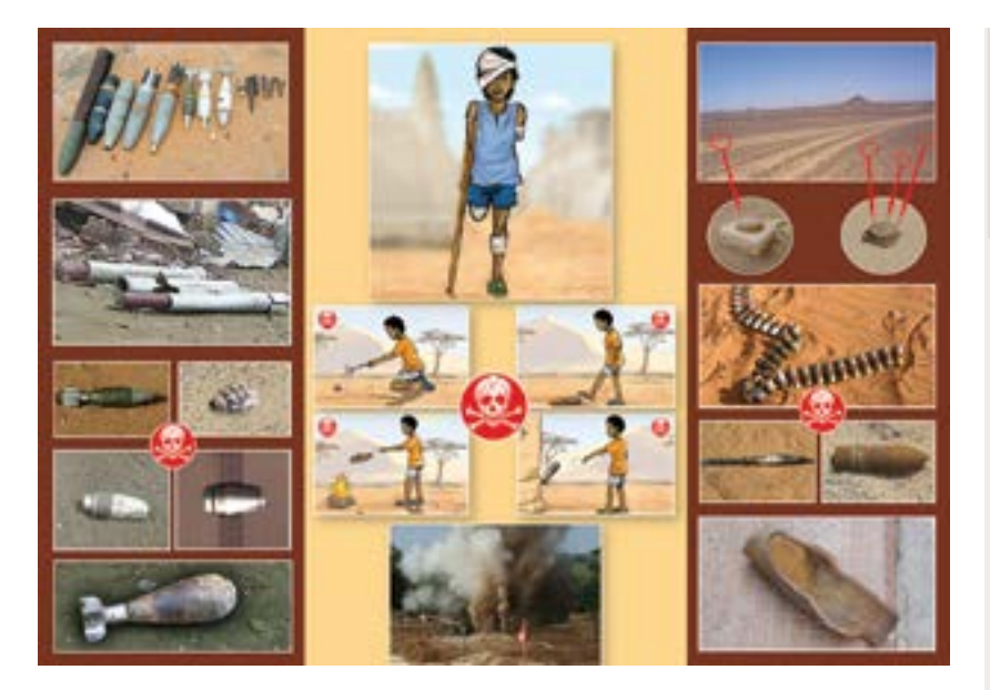
Figure 7. MRE material has no words, as numerous languages are spoken in Mali and many persons are illiterate.

and excel in the final test. During the course, grading depends on participation, while the MRE session presentations are valued higher than the final test. The core facilitators, usually two persons and a group of trusted senior participants grade each participant on seven criteria throughout the week: participation, motivation and interest, resourcefulness (during presentations), teamwork, presentation and communication skills, analytical and problemsolving skills, and negotiation skills.3 In the afternoon of Day 3 or in the beginning of Day 4, these criteria need to be shared for transparency.