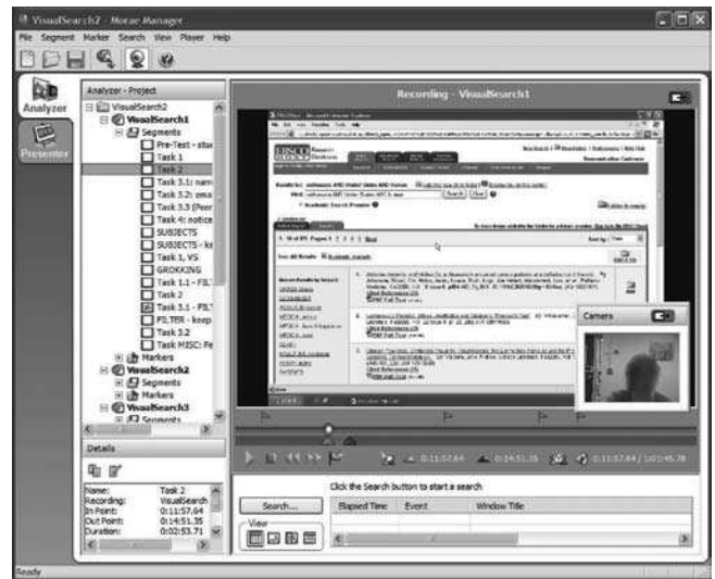
Figure 2. Screenshot of Morae Recorder Analysis Tool

Usability study participants were recruited by posting an announcement to the JMU students' Web portal. A $25 gift certificate was offered as an incentive, and more than 140 students submitted a participation interest form. These were sorted by the number of years the student(s) had been at JMU to try to get as many novice users as possible. Because so much of today's student work is conducted in groups, four groups of two, as well as four individual sessions, were scheduled, for a total of twelve students. JMU librarians who had received both human-subjects training and an introduction to facilitation served as facilitators to the usability sessions. Their role was to watch the time and ask open-ended questions to keep the student participants talking about what they were doing.