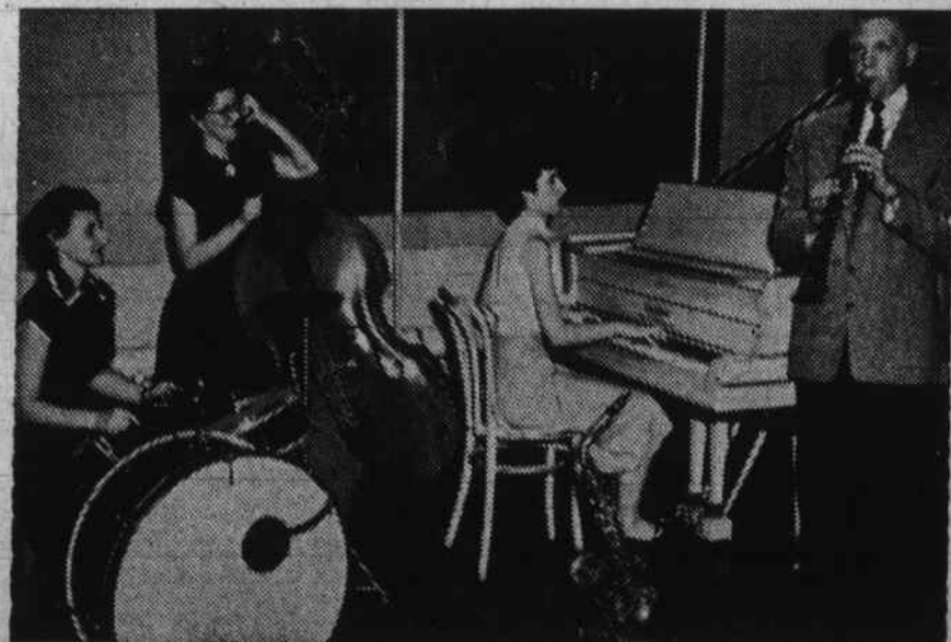
Madison College Starlighters