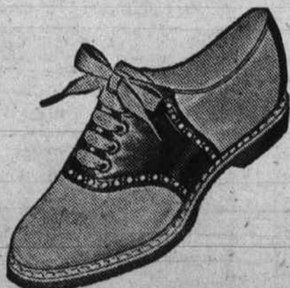
THE SADDLE OXFORD