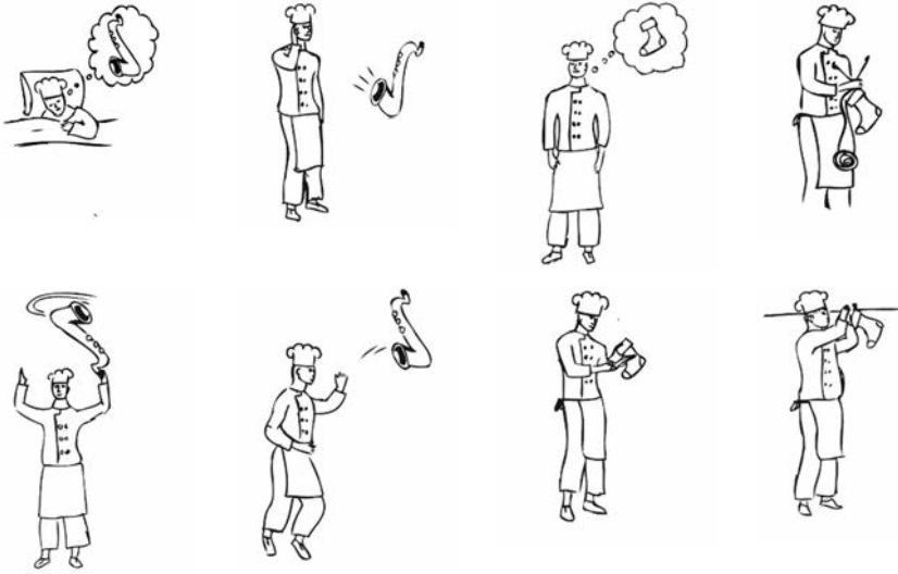
FIGURE 1. Stimulus materials showing intensional and extensional events.

Figure 1 shows a subsection of the stimulus materials depicting the cook as the agent. In the illustrations showing intensional events he dreams of a saxophone, hears a saxophone, thinks of a sock, and knits a sock. In the illustrations showing extensional events he swings a saxophone, throws a saxophone, cuts a sock, and hangs up a sock.