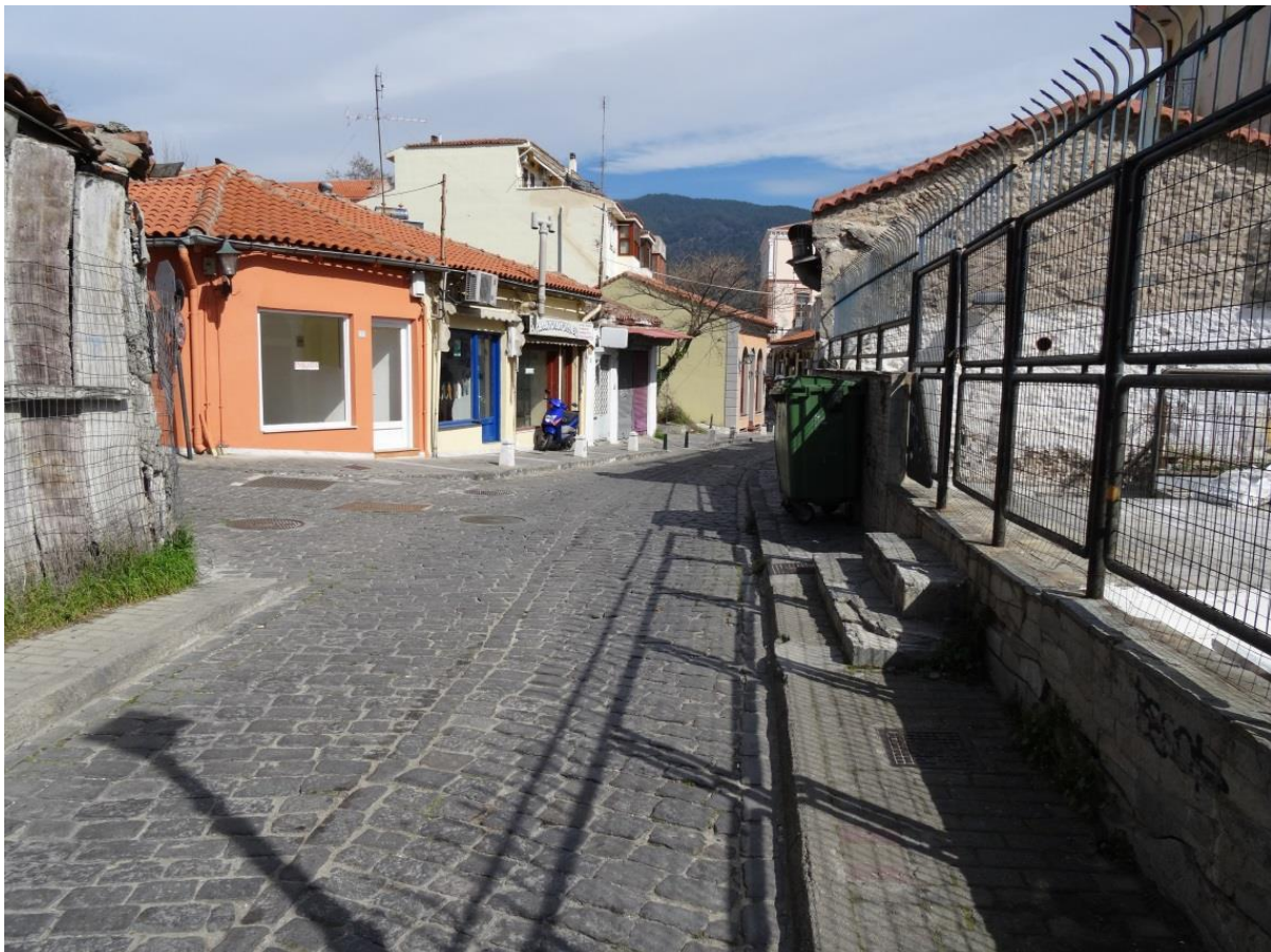
Figure 3 Sidewalks occupied by trash cans, constructions, scooters. This T-type intersection could be safer after the placement of underground trash buckets, the reconstruction of various elements and the demolition of ramshackle buildings.

Obstacles to be removed from the sidewalks to maximize the safety of an intersection, besides the vehicles, are fixed objects such as bus-stop shelters, protrusions for mounting garbage containers, sizable trees on narrow sidewalk, lighting poles, kiosks etc. Another type of obstacle for the pedestrians is the safety rails in front of the entrance of schools, combined with signs or other arbitrary structures (Figure 3).