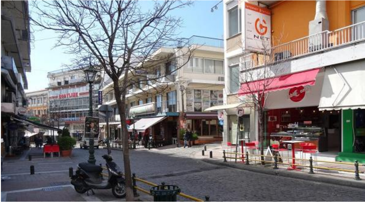
Figure 1 Vehicles have been given the amount of space required for their comfortable passage. This is a proper layout to accommodate pedestrians.

The walkways are not decoration elements. They are the pedestrian crossings; thus, they ought to be smooth, without obstacles and brightly painted. In Xanthi's urban area, it is not an infrequent phenomenon the crossings with faded stripping lines (Figure 2)