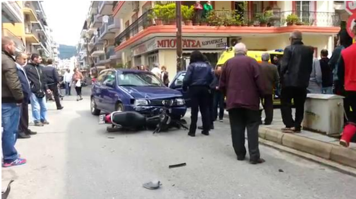
Figure 4 Accident at an intersection. The responsibility is on the elderly car driver.

At the intersection of Anatolikis Thrakis and Andrianoupoleos streets, the traffic is controlled with a pulsating yellow light as well by directory and prohibitive signs. For the recorded accident, the responsibility is fully on the driver's side because he had driven his private car on the opposite way. However, despite both streets serve one way movement, the site frequently is the theater of accidents due to reduced visibility (Figure 4).