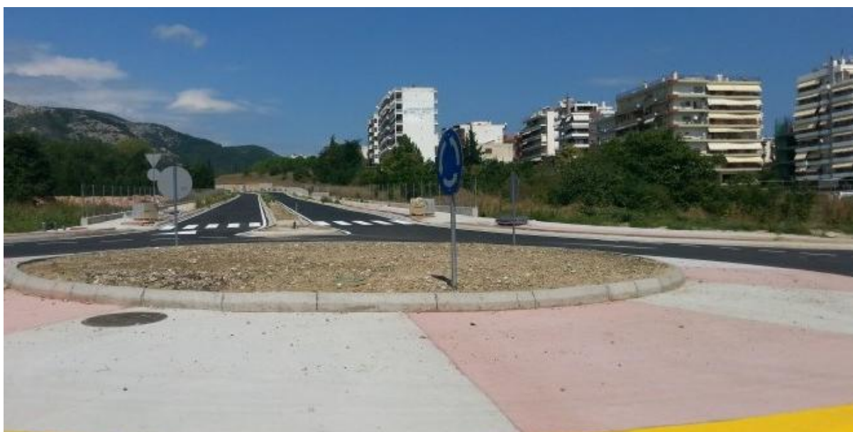
Figure 5 The circular intersection has been opened to traffic in December 2014

Two circular intersections have recently been created (Figure 5) while another one already existed in the urban web. Hence, the experience could not be considered as sufficient. However, it can be said that the number of accidents in the existing junction is very limited.