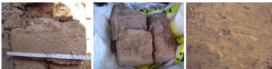
Figure 4 In situ, macroscopic and microscopic figures of a traditional earth block

Earth blocks (Fig. 4) were compact, with dimensions 30x15x10cm, manufactured with clay of local origin. Inert material, such as fine aggregates, wooden fibers, straw, was added in order to increase their stability and flexural strength. Their compressive strength was low, around 0.5MPa, while their porosity was around 10% and Apparent specific gravity 1,7. As expected, their water absorption and capillary sanction was high and led to material detachments.