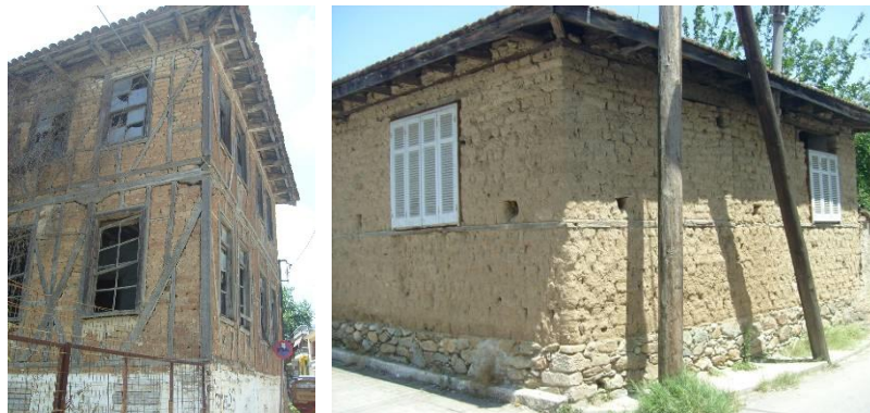
Figures 1-2 Earth-block houses of N Greece (town of Goumenissa)

In SE Europe they are usually located in lowland villages and mountainous settlements. Some of them are still inhabited, others have been abandoned. They are considered as cultural heritage of vernacular architecture, since they are constructed with earth blocks and mud-mortars of local raw materials and by using traditional techniques (Figs.1-2).