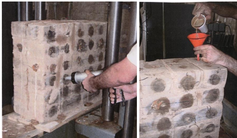
Figure 6 Grouting earth block masonry with soil based grouts

Before the grout penetrations, the walls have been subjected to pulse waves' velocity measurements made on the wall with sonometer in order to estimate the cracks or discontinuities of the crushed masonry walls. After one month period of curing at room conditions the consolidated masonry models were crushed again (Table 4). Measurements of the pulse waves' velocity were also made before the appliance of compressive loads. An adequate number of earth block masonry walls were crushed.