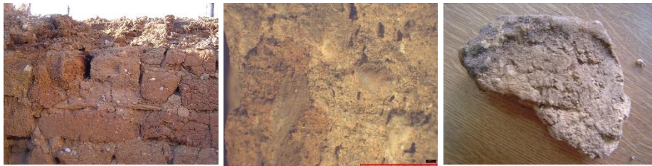
Figure 5 In situ, macroscopic and microscopic figures of structural mortars

Binder/Aggregates (B/A) ratio was around 1/1,5. Compressive strength was around 0.6MPa, porosity 23% and apparent specific gravity 1.6