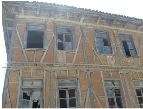
Figure 3 Wooden beams and conjunctions of earth-block structure

The common damages confronted in earth-block structures can be divided in two main categories. The ones concerning the facades of the masonry and those referring to the bearing capacity of the structural elements. They can be synopsized as following [5]: