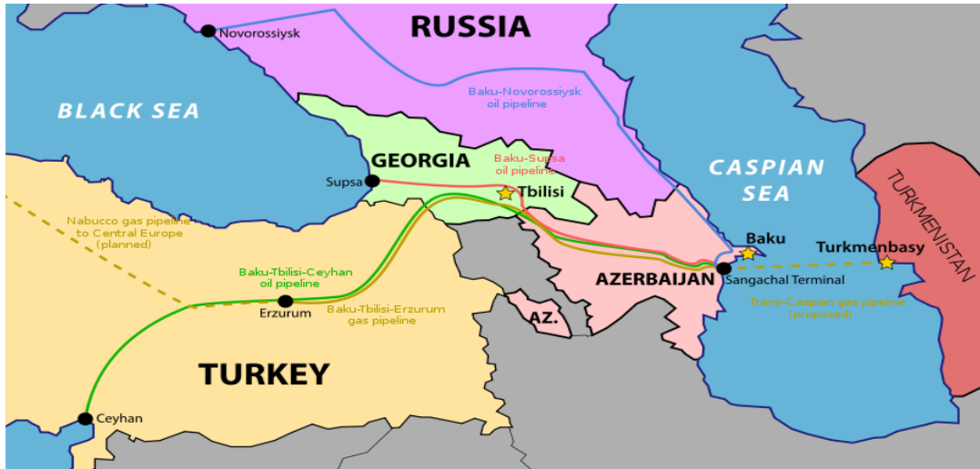
Figure 4. Overview of Baku-Tbilisi-Ceyhan (BTC)