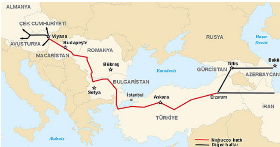
Figure 3. Overview of nabucco pipeline