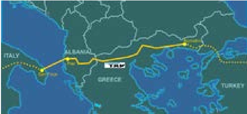
Figure 5. Overview of Trans Adriatic Pipeline project