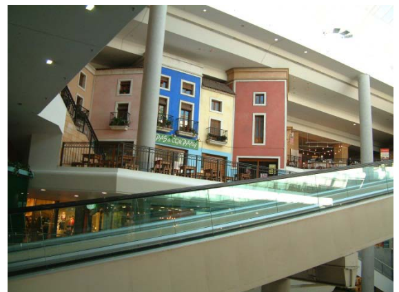
Fig. 9: Shopping Centre “Gran Vía” in Alicante.