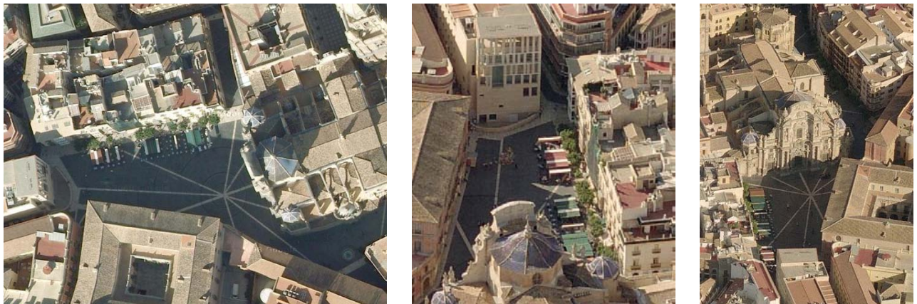
Fig. 4: The Cathedral of Murcia and its surroundings. Cardenal Belluga Square

If we had to choose a representative urban renewal project in the city centre of these two cities, probably the best example would be the Cardenal Belluga square by Rafael Moneo. The objective of this project was to reconsider the urban space and the vacant spaces around it. A new building for the town hall administration was built and the urban space has been reorganized. Not only the pavement treatment has been conceived for a pedestrian user-friendly public space and the best perception of surrounding buildings but also the different functions have been reorganized: a strip for outside cafeterias opposite the main historic buildings.