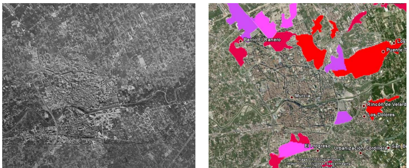
Fig. 3: Changes in the use of land in Murcia and its surroundings between 1977 and 2006.

In the urban area of Murcia occurs a strong occupation of new land, both according to a growth in continuity with existing city and with a discontinuous nature near existing towns. The new developments are situated occupying the outside of the city, with the exception of the western edge where the A-30 Murcia motorway establishes a limit that does not vary in this period. Northward the free area between the urban occupation and the A-7 highway is clearly reduced; in the western area an important transformation of previous agricultural land –market garden- has been transformed in new residential areas following the existing rural roads; and to the South, the gap between the city and the South ring road is filled with new residential uses.