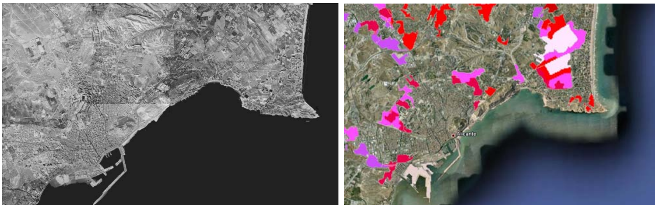
Fig.2: Changes in the use of land in Alicante and its surroundings between 1977 and 2006.

Between 1987 and 2006 in Alicante and its area of influence, there has been an important occupation of soil, in continuity with the central city itself, as in other coastal towns and inland.