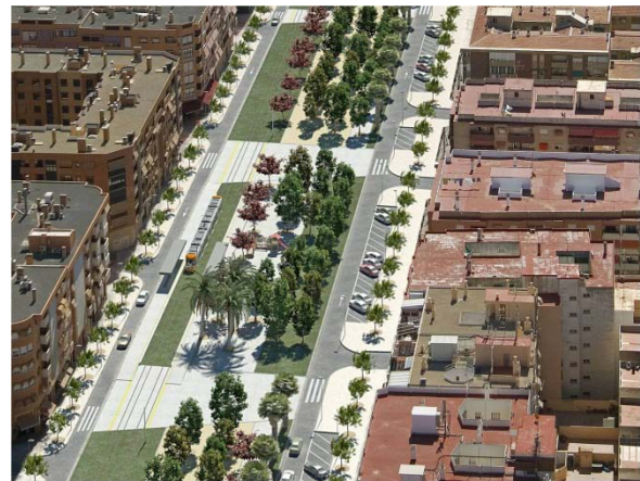
Fig. 6: “The Tramway of Alicante. Boulevard del Pla.”