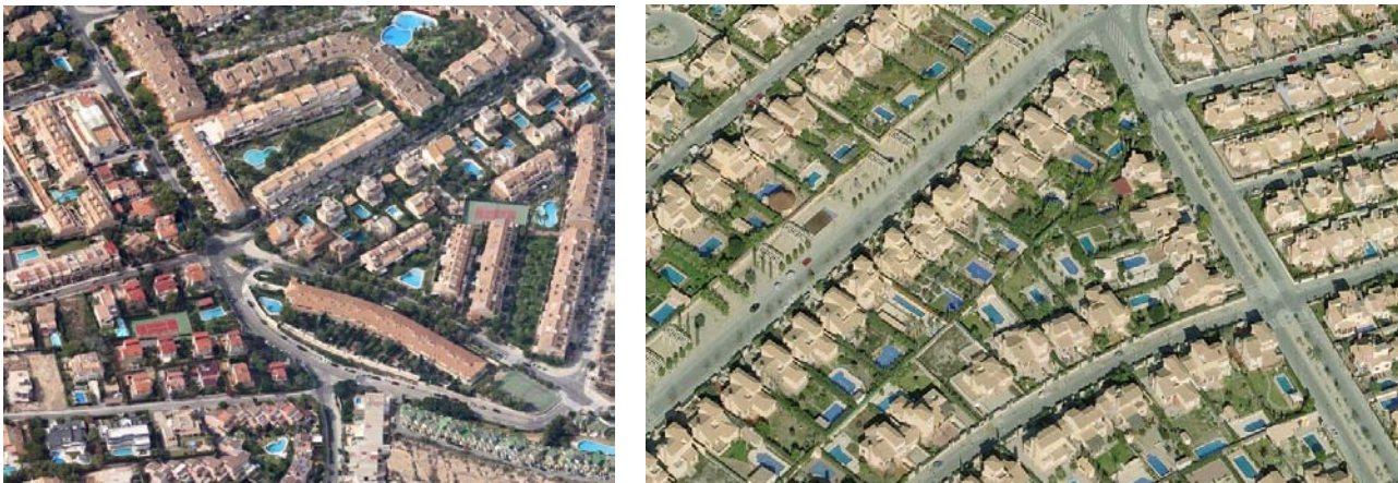
Fig. 10: Discontinuous urban fabric surface in Alicante and Murcia outskirts.

The influence of the new city on public spaces is quite important in we consider two circumstances: on the one hand these type of urbanizations do not have any public space as the inhabitants choose these houses because they have their own private free space in the interior of their plot and, on the other hand because less citizens need to use public space in the central city or in nearby neighborhoods.