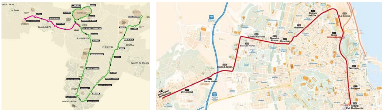
Fig. 5: The Tramway of Murcia and Alicante.

In both cities, during the last decade an important new strategy has been developed concerning public transport within the urban area: the implementation of a new tramway or light metro linking the city centre and the suburbs or recent developed areas.