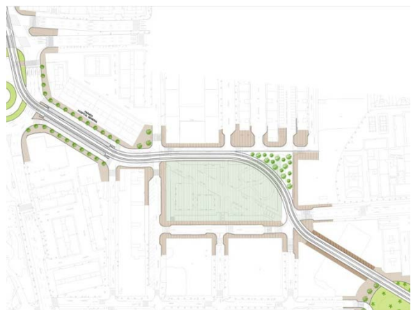
Fig. 7: “The Tramway of Alicante. Gastón Castelló Square.”