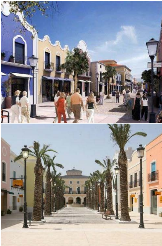
Fig. 8: Shopping Centre “La Noria” in Murcia.

Two examples of extreme design can be found in both cities: the shopping centre of Gran Vía in Alicante and the Outlet La Noria in Murcia. In both cases the design of facades and the private free space has been a copy of traditional Mediterranean squares and buildings –including, institutional buildings or churches- without any consideration to scale or truthfulness.