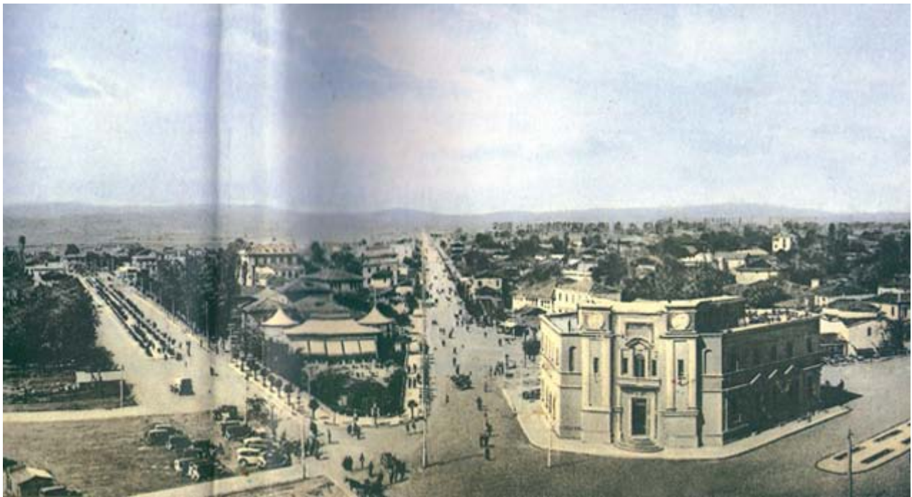
Fig. 6: Musolini boulevard (Today the Kavaja Street), Kursali Kafetria (Known as Tajvan Cafeteria), Mother Queen Boulevard (Today Durresi Street), and the old municipality

“It was a big and important building. With its heavy and monumental shape it impost you the fear and the respect for the government. It was fear to pass next to it, and if you had to enter there... there were problems... (Laughing)”- a habitant of Tirana.