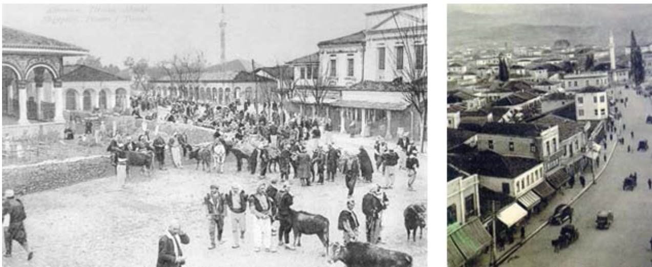
Fig. 4: Old Bazaar, Foto of 1939, on the left and on the right, The old bazaar and the old mosque seen from the clock tower.

The first stone in the city of Tirana was the old bazaar. Tirana, firstly a village was in the middle of Albania in a good position for the trade and the changing of goods. According to Kera Passenger were meeting in Tirana to buy, sell and rest before they proceeded in other city. (Kera, 2004) The symbols the marks and the outlines of the old bazaar are erased from the place that it used to be and nowadays mostly even from the memories of the habitants. Just a few still say: “At the old Bazaar....”