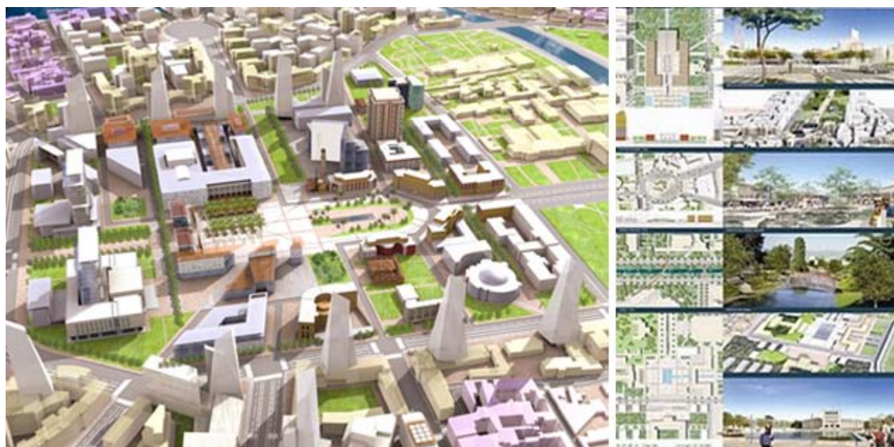
Fig. 7: Model in 3d and renders the the Architecture Studio proposed for Tirana’s city center

The habitants of Tirana has shown that mostly of the time suffer and swallow the feelings for a place even that they don’t agree with the decisions of the government or the municipality for a certain place. Drastic changes happened after the year 2000 in the city, while again the urban plan for the city center was again left in the hands of foreign architects. Tirana Center was again a Tabula Rasa. Renders and beautiful images shocked the habitants which understood the drastic changes after some of the projects ideas were implemented. It took a while to comprehend that it couldn’t turn back the old, behaviors, memories, attitudes about these places.