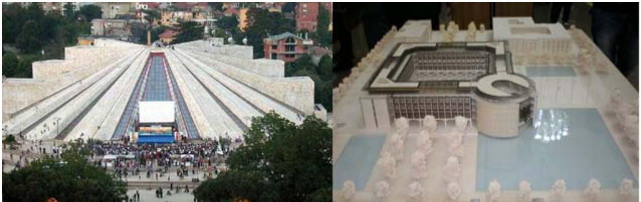
Fig. 8: Left, the existing building of Piramida, the National Culture center, as a public place- Right-the new model proposed by a Austrian architecture studio, parliament Building- the offices of the government

“I took my first kiss, under that big tree, in the Piramida’s park. There we engraved our names. We were sitting there every time we met. It was our place”.