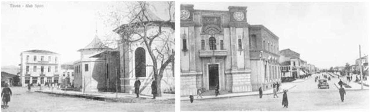
Fig. 5: Left- Kursali Cafeteria, known by the habitants as “Tajvan Cafeteria” and Sport club Tirana, right view- The old Municipality, knock down in 1981.

Next to this cafeteria the Italian architects used to build a two floor building with neoclassical elements which was demolished in 1981 to open one street and to build the national museum at that same place.