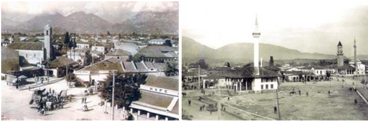
Fig. 3: Entry of the “Xhemal Pashe Zogj” street, today “Dibra Street, on the left ST. Evanghelizmu church on the right the old Bazaar. Demolish during the communism peiod. Karapici Mosque- demolished to built Tirana’s city hall in 1939