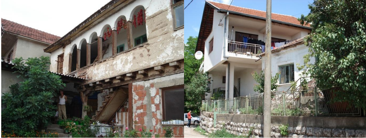
Figure 3: Houses in Household 11 (left) and in Household 12 (right)

others included some kind of farming and gardening that affects the quality of living conditions if there is no zoning as it is the case here. (Figure 4)