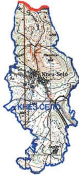
Figure 2: The Map of the village Knez Selo district