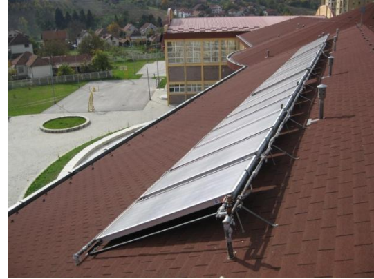
Figure 2: Solar system of High School of Food and Hospitality in Cacak, Serbia (Dragičević, Plazinić, & Jovanović, 2011)

The project consists of two parts. The first part encompasses the installation of solar panels for the purpose of using alternative energy sources in the city of Čačak. The first installation was set up in the Food and Catering School, being consisted of 40 m 2 highly selective flat plate collectors that heat up to 2 m 3 of sanitary water per day. (Dragicevic, et al., 2011) The entire assembly is controlled automatically which, in addition to the controlling function, has a measuring role as well. There are two devices set up on the system, one for measuring the consumption of sanitary water and another one, used for measuring the amount of thermal energy produced by the system (Mitrovic, 2010).