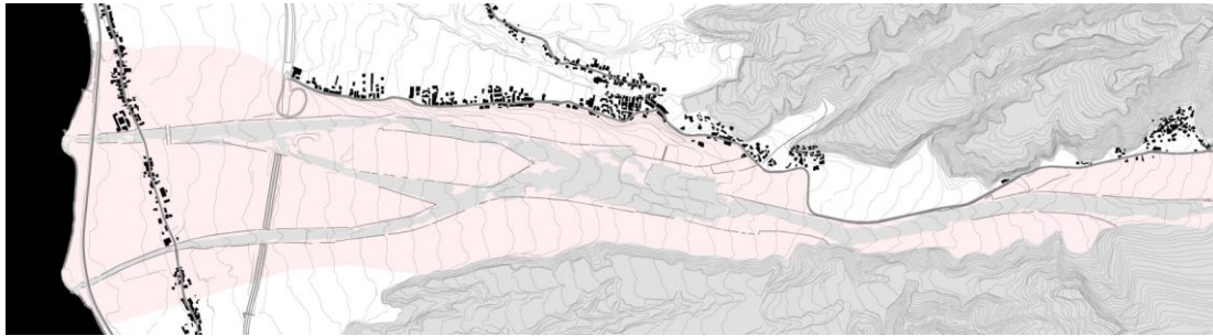
Figure 2: Valanidi Stream, Map of the constitutive elements of the landscape. (Author)

background and will constitute, as well as evidence of the design process, a means to make intelligible the design choices and facilitate the assimilation of the new landscape.