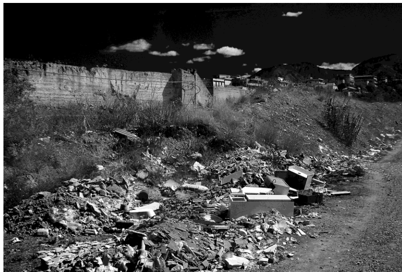
Figure 1: Reggio Calabria: The Valanidi Stream.

Riverscapes are ascribable in this category. Water courses of different sizes and flows, are still shaping the landscape by digging, eroding and transporting, meandering with unpredictable variations. Their role was fundamental into the civilization process and, during the ages, the objective of their control and use has led the man to struggle to subvert their natural order; with results that however are still showing deep uncertainty. (Middleton, 2012).