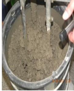
Figure 4: Concrete mixture