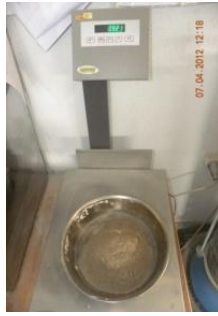
Figure 1: Fly Ash