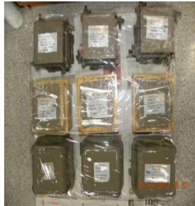
Figure 6: Maintenance of the samples [4]