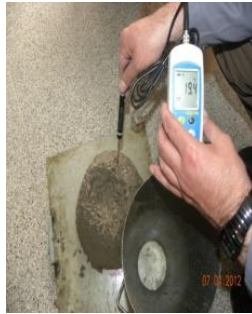
Figure 2: Temperature