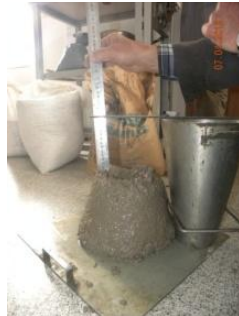
Figure 3: Consistency