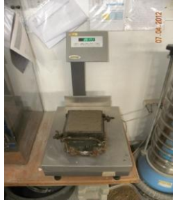
Figure 5: Mass of wet concrete