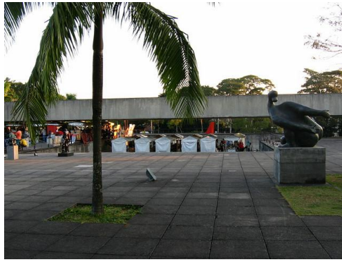
Figure 10: Brazilian Museum of Sculpture in São Paulo

MUBE ( Museu da Escultura Brasileira / Brazilian Museum of Sculpture ). Since the mid-1980s Mendes da Rocha's work has made the public realm central to his work. MUBE was built between 1986 and 1995, and is not really a building at all, but a square on a street corner. The museum is essentially subterranean, set beneath a concrete beam, no less than 60 meters in length and supported only at each end. This is not a space of free expression, but of politeness. It is far less ambitious in concept than the Memorial; it occupies an already privileged space.