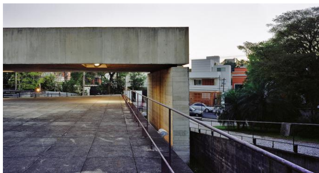
Figure 9: Brazilian Museum of Sculpture in São Paulo

Brazilian architect Paulo Mendes da Rocha is known for socially responsible architecture that uses simple shapes and minimal resources. Paulo Mendes da Rocha often called a "Brazilian Brutalist" because his buildings are constructed of prefabricated and mass-produced concrete components. Pritzker-prize winning architect da Rocha is known for bold simplicity and an innovative use of concrete.