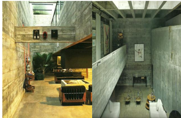
Figure 8: Casa Leme -Millàn interior