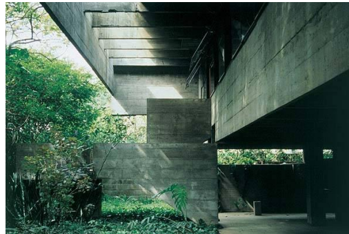
Figure 12: Mendes da Rocha Residence, São Paulo

Brutalism in Brazil was a radically introverted architecture, creating often luxurious interior worlds, but at the expense of positive engagement with the world outside. Unlike in England, for the most part it did not become an official style, except for university buildings. Its indifference to the exterior world is perhaps a metonym for the tendency's ideological xenophobia: this was an ideologically, as well as physically, inward-looking architecture. This inwardness contrasts directly with the presentation of Brutalism in Europe, where buildings often make a direct address to their surroundings, and may have decorative or highly modulated exteriors.