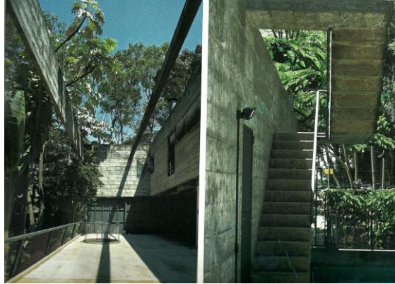
Figure 7: Casa Leme -Millàn exterior