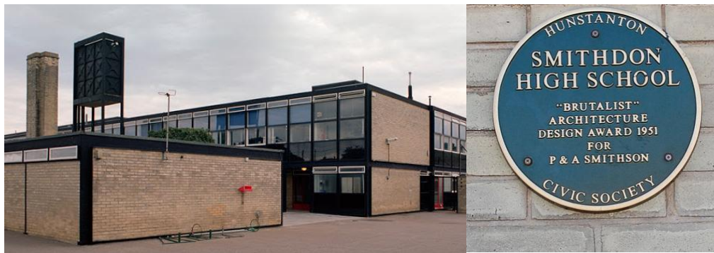
Figure 1: Secondary Modern School at Hunstanton

Peter and Alison Smithson were seen as the pioneers for the Brutalism movement in Britain. The first reference to the New Brutalism was made by Alison Smithson in 1953. In 1954, the two architects Alison and Peter Smithson completed the Secondary Modern School at Hunstanton which was at once accepted as the first Brutalist building. Soon afterwards, they proposed a definition of the budding movement. In a brief and enigmatic statement (one of only two in which they have attempted a clarification), they enlisted traditional Japanese architecture to illustrate the new approach. The Japanese, they argued, showed 'a reverence for the natural world and, from that, for the materials of the built world'. This reverence participated in a general conception of life, leading the Smithson's to declare, famously, that 'we see architecture as the direct result of a way of life'. Notwithstanding the engaging simplicity of these ideas, they were somewhat lost among miscellaneous considerations on Modernism and could hardly have precipitated an architecture movement.