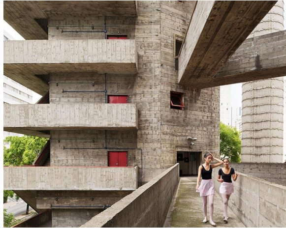
Figure 6: SESC-Pompéia, São Paulo, 1977

Even more extraordinary is Bo Bardi's last major building, the Servico Social do Comercio (SESC)- Pompeia (1977–86) , a publicly funded arts and leisure co-operative in a post-industrial no-man's land. The SESC occupies the site of a former brick factory, and reuses a number of low, functional brick structures from it. Bo Bardi described the holes as 'prehistoric', turning the users of the building into temporary cave dwellers. The SESC complex became hugely successful, and now contains theatres, gymnasiums, a swimming pool, snack bars, leisure areas, restaurants, galleries, workshops and other kind of services.