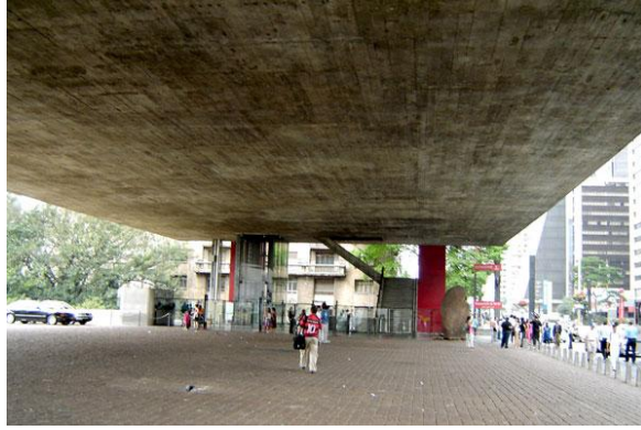
Figure 4: Museu de Arte de Sao Paulo (MASP) 1957 -68