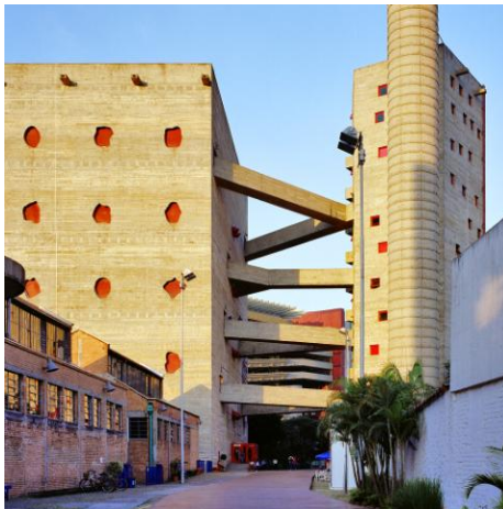
Figure 5: SESC-Pompéia, São Paulo, 1977

The MASP project materializes a number of crucial ideas in Bo Bardi's thought. MASP remains if nothing else an astonishing form and its programme of public space is one of the most successful in the history of modern architecture. This is a modern space that appears to be both well used and well liked.