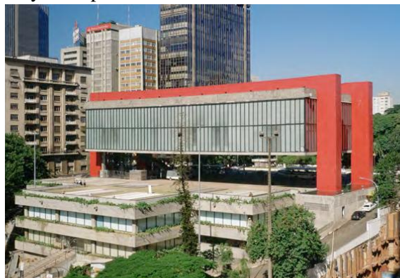
Figure 3: Museu de Arte de Sao Paulo (MASP) 1957 -68

Over the next 30 plus years, Bardi would participate in an astonishing number and variety of projects. She designed private homes (both exteriors and interiors), including her own São Paulo home, the Glass House (1951), an early example of the use of reinforced concrete in domestic architecture.