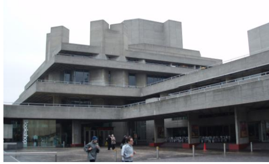
Figure 11: Southbank Centre, London