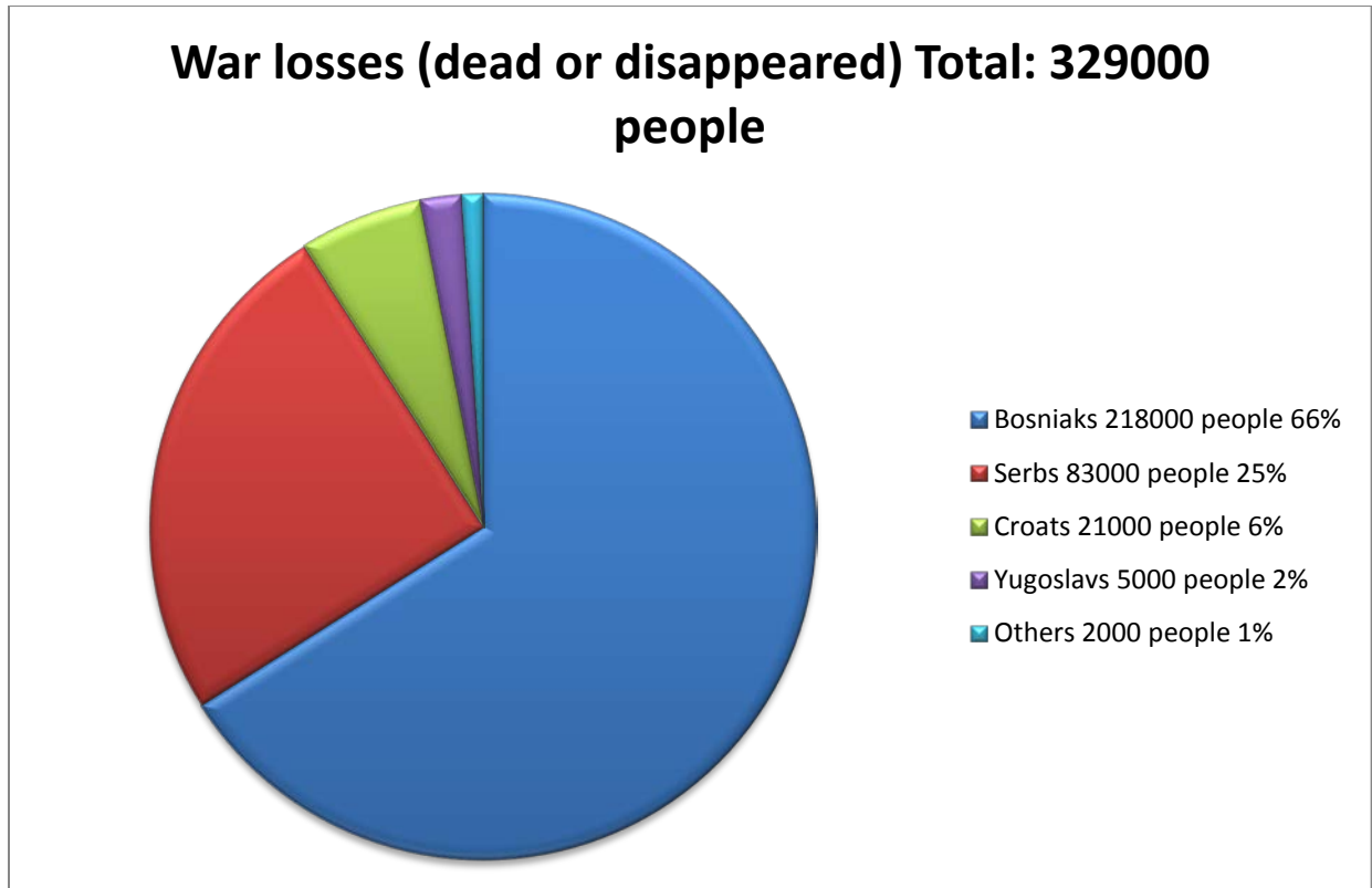
Figure 1. Describing the dead or disappeared people during the Bosnia and Herzegovina War statistics taken from “Demographic Consequences of the 1992-95 War” by Murat Prašo. (Prašo)

So according to the statistics the majority of the dead or disappeared during the Bosnia-Herzegovina Conflict were Muslims coming from Bosnian ethnicity.