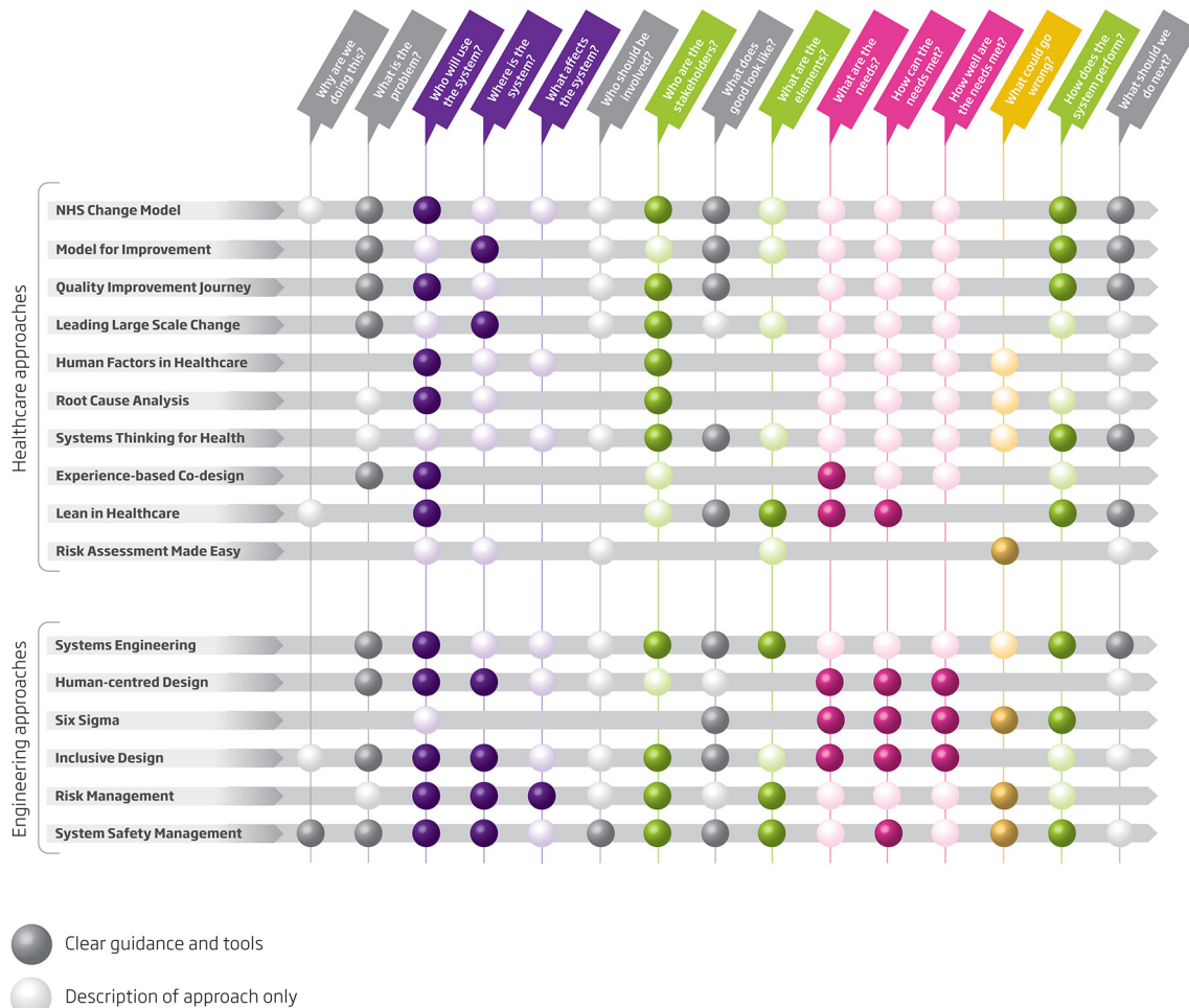
Figure 2 The ability of both engineering and traditional approaches to healthcare improvement to answer the key questions of a systems approach. Reproduced with permission from Engineering Better Care, Royal Academy of Engineering, Academy of Medical Sciences and Royal College of Physicians, 2017

techniques it has developed provide powerful insights into the planning and implementation of interventions to complex systems, and incorporating these into a wider systems approach may be of enormous benefit to clinicians and academics seeking to address global health challenges.