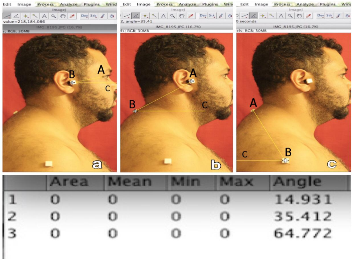
Figure 1. Measuring the three body angles: a) sagittal head angle (SHA); b) cervical angle (CVA), and c) shoulder angle (SA) by using ImageJ.