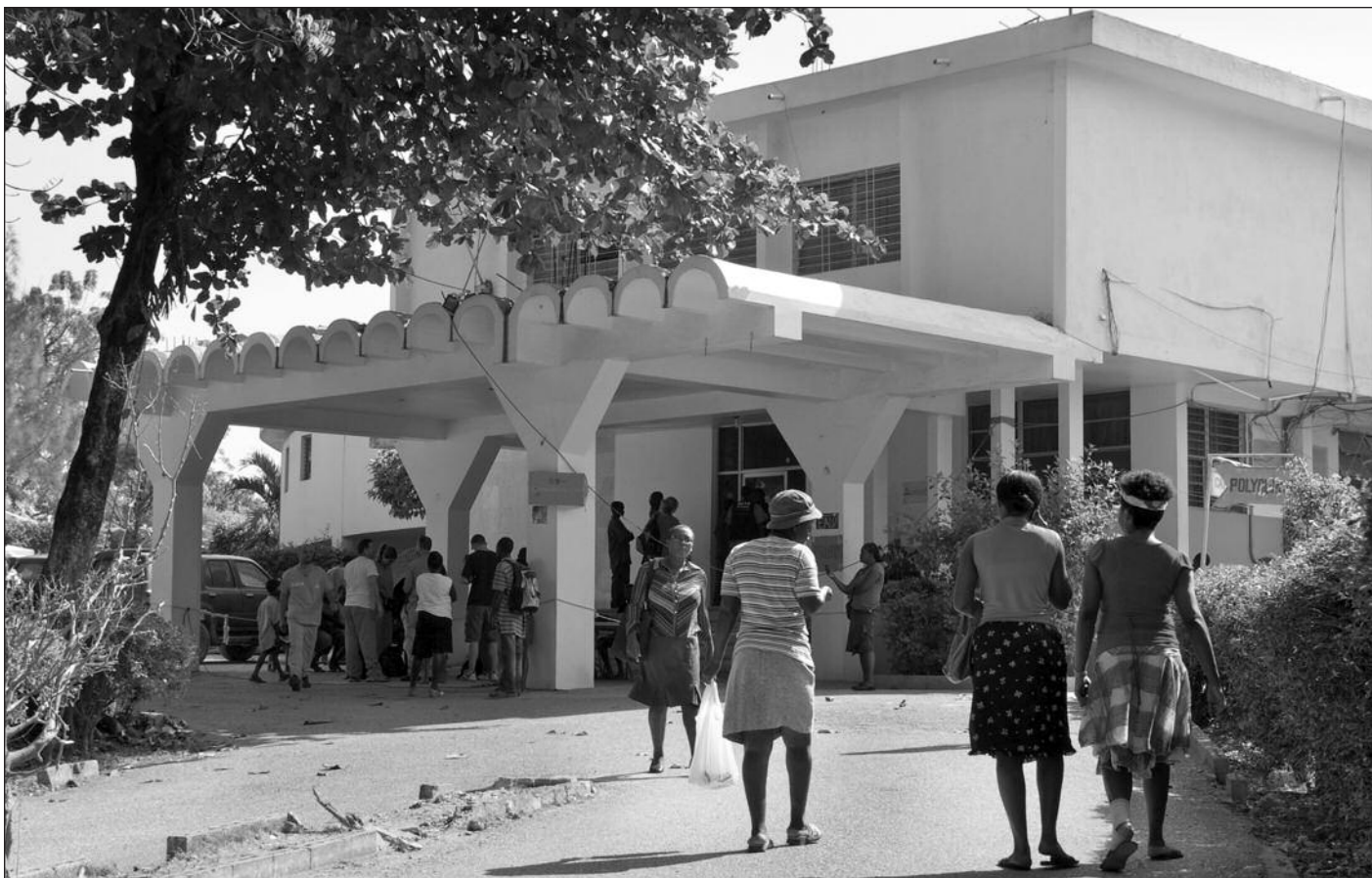
Hopital Adventiste d'Haiti has been serving as a clinical center for the country.

Individuals who would like to donate to the relief effort of HAH are invited to visit the website at < www.llu.edu/news/haiti > or to contact the LLU office of philanthropy at P.O. Box 2000, Loma Linda, California 92354. The phone number is (909) 558-5010. Please make checks payable to: Loma Linda University—Haiti Earthquake.