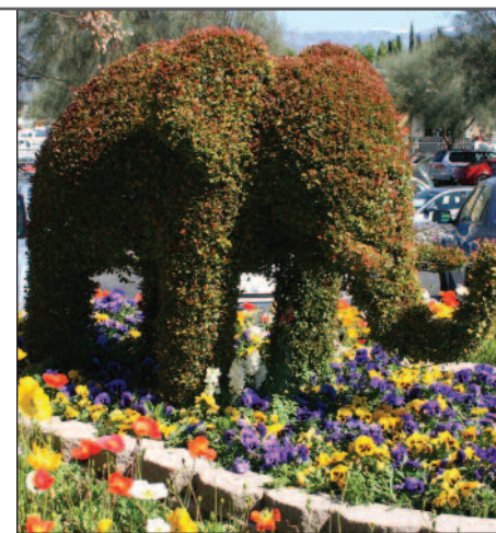
A life-sized replica of a three-year-old African elephant adorns the flower bed out front of the LLU landscaping department on Stewart Street in Loma Linda. The living sculpture—made of rebar covered by a Eugenia plant—was donated by the gentleman who made the topiaries in front of Disneyland.

"If there's one whisker out of place," he reports, "the maintenance workers trim it right off. We appreciate the kindness of the gentleman who donated this to our facility. One of these days, if we can find the right place for it, we'd like to move it back to Children's Hospital."