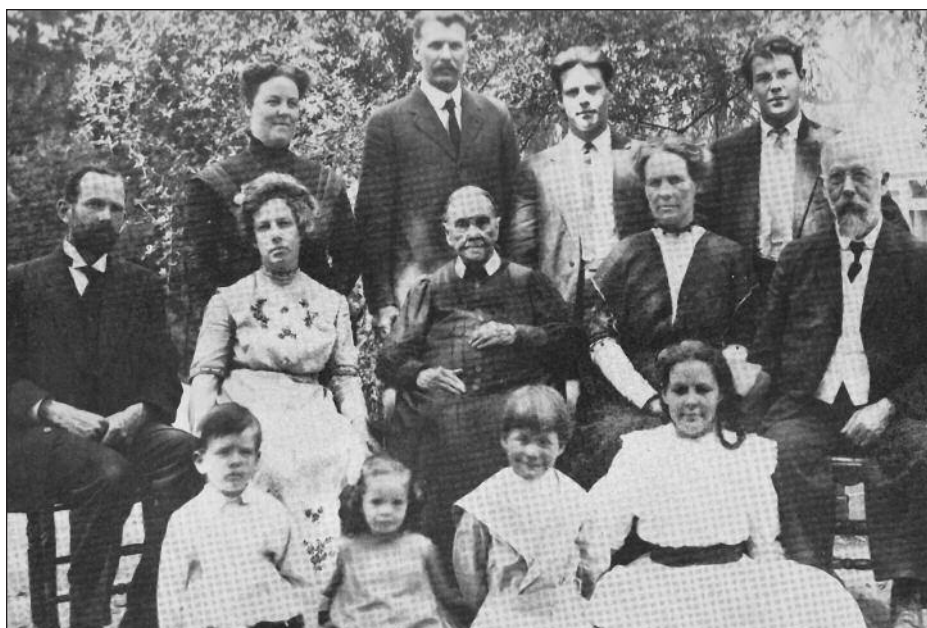
ELLEN G. WHITE AND HER FAMILY IN 1913