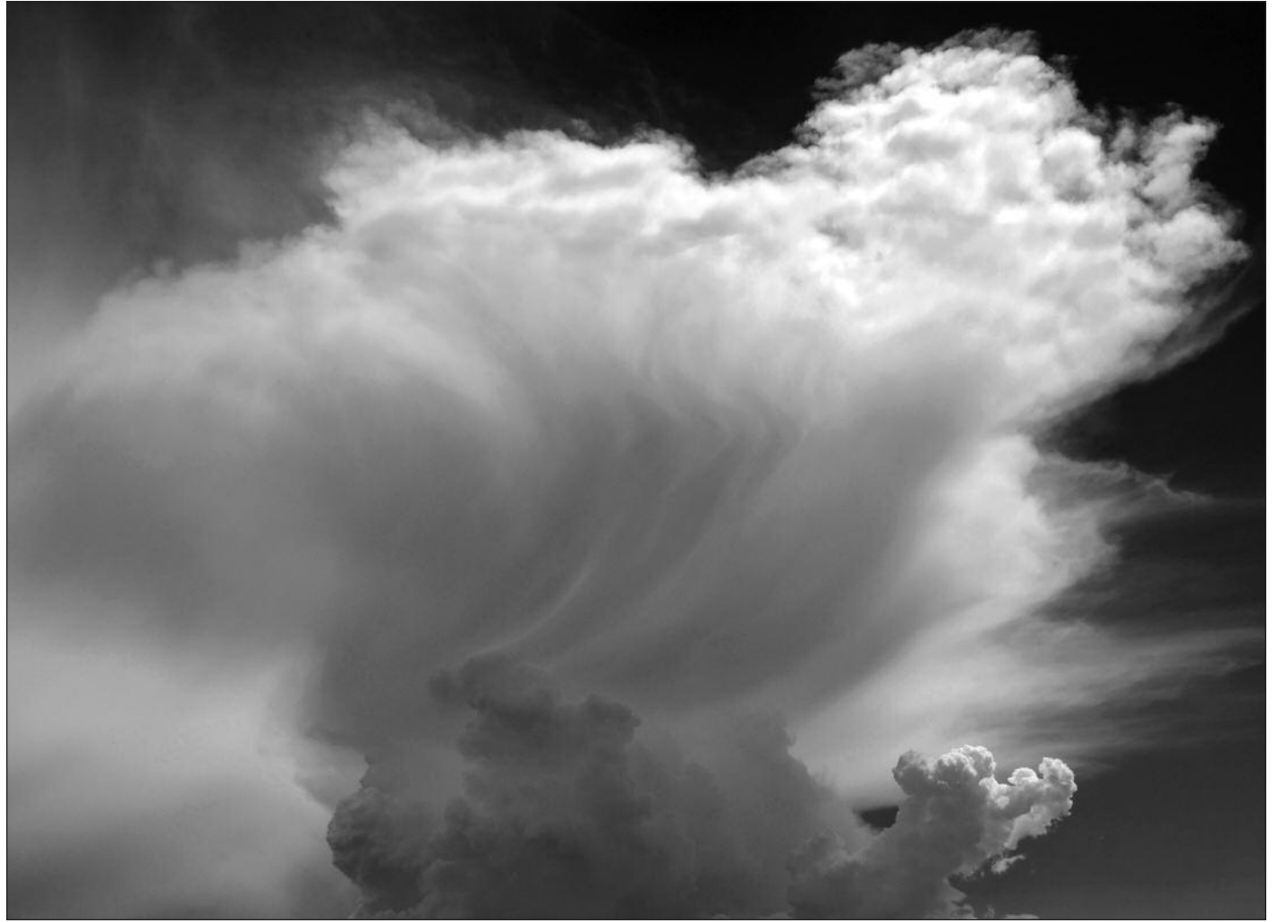
A monsoon thunderhead drifts over the campus of Loma Linda University the afternoon of Thursday, August 26, 2010. With several news agencies identifying this as the warmest year on record worldwide, 2010 is living up to its reputation in Loma Linda where temperature and humidity measurements held steady at uncomfortable levels for most of the summer and into the early days of fall.