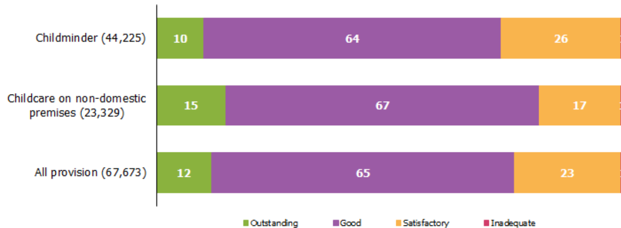
Chart 2: Overall effectiveness of active early years registered providers at their most recent inspection as at 31 March 2013, by provider type (provisional) 1 2 3