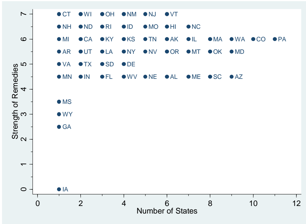
FIGURE 2: PRIVATE ENFORCEMENT STRENGTH OF STATE UDAP LAWS

consumers to seek compensation or damages without having to prove that they have in some way relied on the deceptive information the seller provided. Because of the state-by-state variation, it is difficult to make meaningful generalizations about UDAP private enforcement regimes beyond the point that they vary.