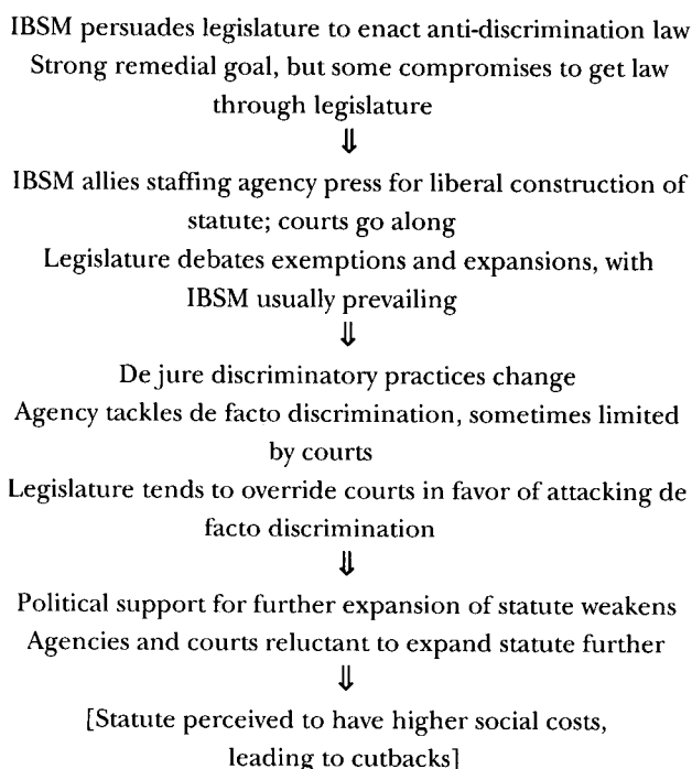
Diagram 3 The Life Cycle of an Anti-Discrimination Super-Statute

nation (“No women need apply”) toward de facto ones (women are hired but are harassed on the job or are not promoted if they have children). At some point, courts will halt the IBSM-inspired agency’s expansion of the statute, and the legislature will debate whether to accept the court’s limits. Generally, legislatures will support substantial effort to eliminate many of the de facto forms of discrimination—until political support for the statute wanes. At that point, ordinary politics is the order of the day, and enforcement of the statute will shift from being considered a moral crusade toward being a strategic game. If the public comes to see the statute that way, I hypothesize that its political support will sink and it will be vulnerable to diminishing relevance or even repeal. Diagram 3 illustrates the life cycle I have described.