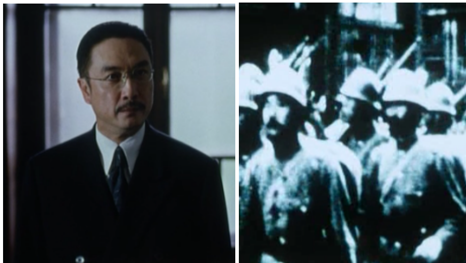
Figure 3: Judge Mei Ru'ao narrates Japan's atrocities while the film plays documentary footage from the war in Tokyo Trial .

As such, Tokyo Trial uses the adversarial process very differently from American trial films. Since the film, like Judge Mei himself, assumes the defendants' guilt from the outset—and declares their guilt through documentary footage—the trial sequences do not reveal competing narratives to be judged, but serve only to reinforce the conviction that the defendants deserve to be punished. Like a public trial, courtroom scenes are carefully choreographed so as to “rally popular sentiment . . . and direct indignation toward targeted opponents.” 103 At no point does the film, or the trial within the film, permit a serious counter-argument to the defendants' presumed guilt. In fact, like Jiang Qing's televised trial, the film omits the defendants' case: while the prosecution makes an impassioned closing argument, the defense's response is conspicuously absent. Instead of pulling viewers “rhythmically back and forth . . . between two positions,” 104 the film pulls viewers in one direction from start to finish.