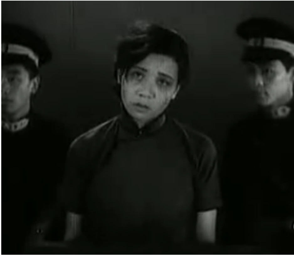
Figure 1: The final trial scene in The Goddess .

The punitive conception of justice is similarly reflected in the development of The White-haired Girl (白毛女/ Bai mao nü ), one of modern China's most well-known operas. 75 The revolutionary opera tells the story of the peasant girl Xi Er, whose father is forced to sell her to their landlord, Huang Shiren, in satisfaction of outstanding debts. 76 Huang Shiren abuses and rapes Xi Er, who flees to the hills and takes shelter in a cave after she becomes pregnant. 77 Eventually, a former love interest, who is a member of the Eighth Route (Red) Army, rescues her. 78 According to the original script, "Huang is not killed immediately, but is arrested 'for public trial according to proper legal procedure,'" 79 and the opera ends with Xi Er testifying against him at trial. 80