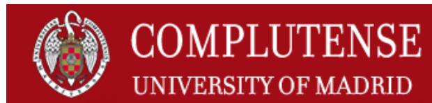
Complutense University of Madrid (Spain)