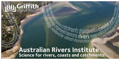
Australian Rivers Institute