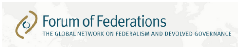
Forum of Federations (Canada)