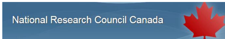
National Research Council Canada