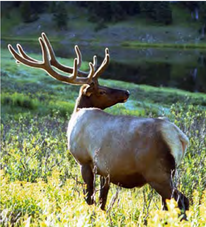
Majestic bull elk in spring velvet.

While current planning efforts still lean towards traditional measures for supplying water, Colorado can chart a new, innovative path forward that protects our rivers, streams, and local communities.