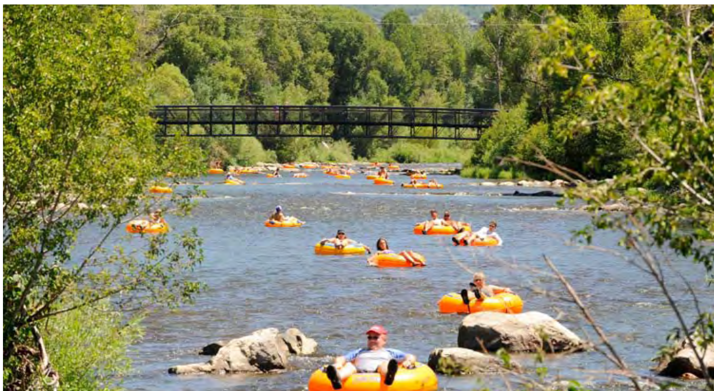
Tubers enjoy the Yampa River near downtown Steamboat Springs.

innovative tools to meet new challenges. The time is now for the state of Colorado and local water providers to embrace new water supply strategies that meet our consumptive water use needs while sustaining the non-consumptive, instream flows that keep our rivers and streams healthy. The methods and ideas laid out in this report should guide choices that are made as we embark on this new era of water supply.