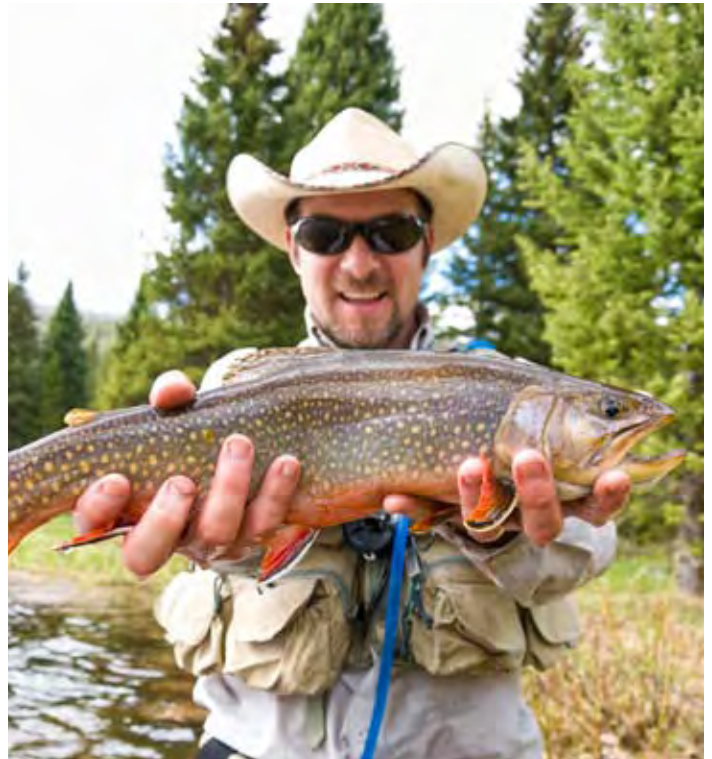
A fine catch.