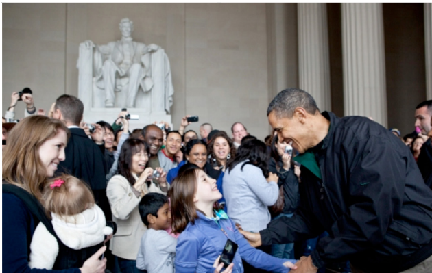
April 9, 2011, The President greets tourists at the Lincoln Memorial.

President Obama has asked Secretary Salazar to co-chair an interagency task force with the Secretary of Commerce to develop a National Travel and Tourism Strategy to expand job creation by promoting domestic and international travel opportunities throughout the United States. A particular focus of the Task Force will be on strategies for increasing tourism and recreation jobs by promoting visits to the national treasures. The Department of the Interior manages iconic destinations in the national parks, wildlife refuges, cultural and historic sites, monuments, and other public lands that attract travelers from around the country and the globe. In 2010, 437 million visits were made by American and international travelers to these lands, contributing $47.9 billion in economic activity and 388,000 jobs. Eco-tourism and outdoor recreation also have an impact on rural economies, particularly in Arizona, California, Colorado, Florida, Nevada, North Carolina, Oregon, Utah, and Wyoming.