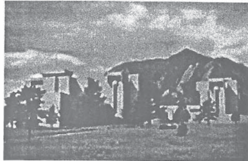
NCAR's Mesa Laboratory serves as the flagship for the institution

Click on topics to the left to learn about the history of the National Center for Atmospheric Research, explore the unique architecture of our laboratory perched on a Boulder, Colorado mesa and discover the research divisions that thrive within.