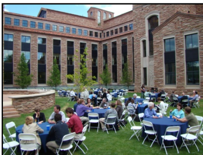
Summer Conference moment