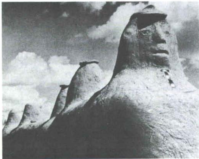
Adobe Guardians, Acoma, NM

A Fellow of the American Society of Landscape Architects, the Institute of Landscape Architects (U.K.) and the Royal Society of Arts (U.K.), McHarg is also an Honorary Fellow of the Royal Institute of British Architects and the American Institute of Architects. He has applied his ecological planning methods to innumerable urban and regional area studies in the U.S. and abroad. Recent projects include planning of a National Parks System for the Government of Taiwan, Republic of China, Gateway National Park in New York for the U.S. National Park Service and "F" Route Transit Study for the Washington Metropolitan Transit Authority, Washington D.C.