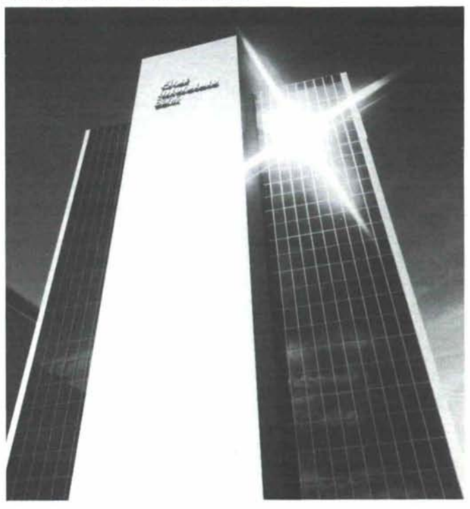
September-October 1987 / 11

The Albuquerque Trust Building