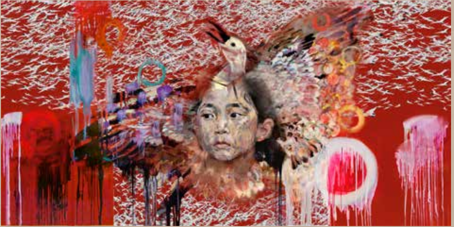
Wings , Hung Liu