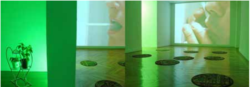
Un chant d'amour , 2005, Galería La Caja Negra, Madrid