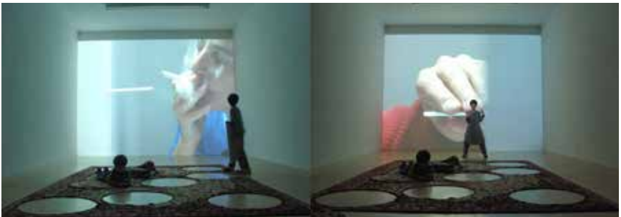
Un chant d'amour , 2005, Participant Inc., N.Y.