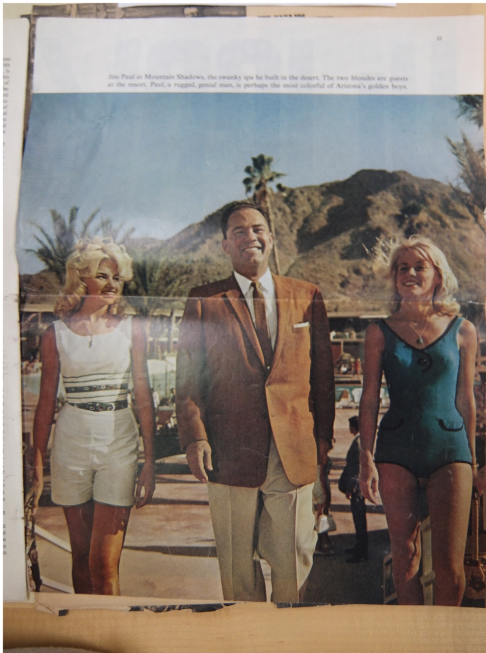
Figure 5.1 This photo appeared in the September 30, 1961 edition of the Saturday Evening Post as part of an article entitled, "The New Millionaires of Phoenix: Penniless And Fiercely Ambitious Young Men Swarm Into This Sun-baked City With Just One Aim – Money." 260