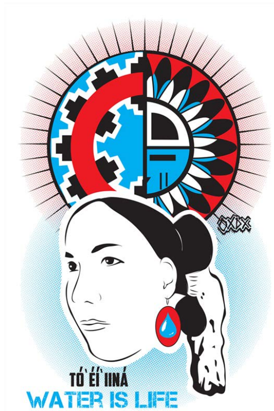
Figure 1.1 Digital print by Jared Yazzie 7

and even in spontaneous graffiti on the sides of water tanks, road signs, and abandoned buildings across the Navajo Nation. While this phrase is by no means unique to Navajo political contexts—indeed, it has become a rallying cry for Indigenous-led political movements all over North America and, as I write this, has become a conspicuous element of the visual narrative that has accompanied the escalating struggle taking place in the Standing Rock Sioux Nation to stop