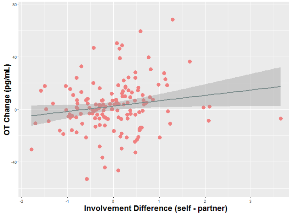
Figure 2. General involvement difference and OT change across the task.

Self and partner-reports of involvement, considered separately. Controlling for reports of partner involvement, higher self-reports of involvement non-significantly predicted a higher OT change, F(1,141) = 2.50 , \beta = .18 , p = .116 , partial \eta^2 = .017 . The effect of partner reports on the OT change, controlling for self-reports, was significant in the opposite direction, F(1,141) = 3.98 , \beta = .21 , p = .048 , partial \eta^2 = .027 , such that reports of lower partner involvement predicted a stronger OT response. See Table 1 for a summary of effects.