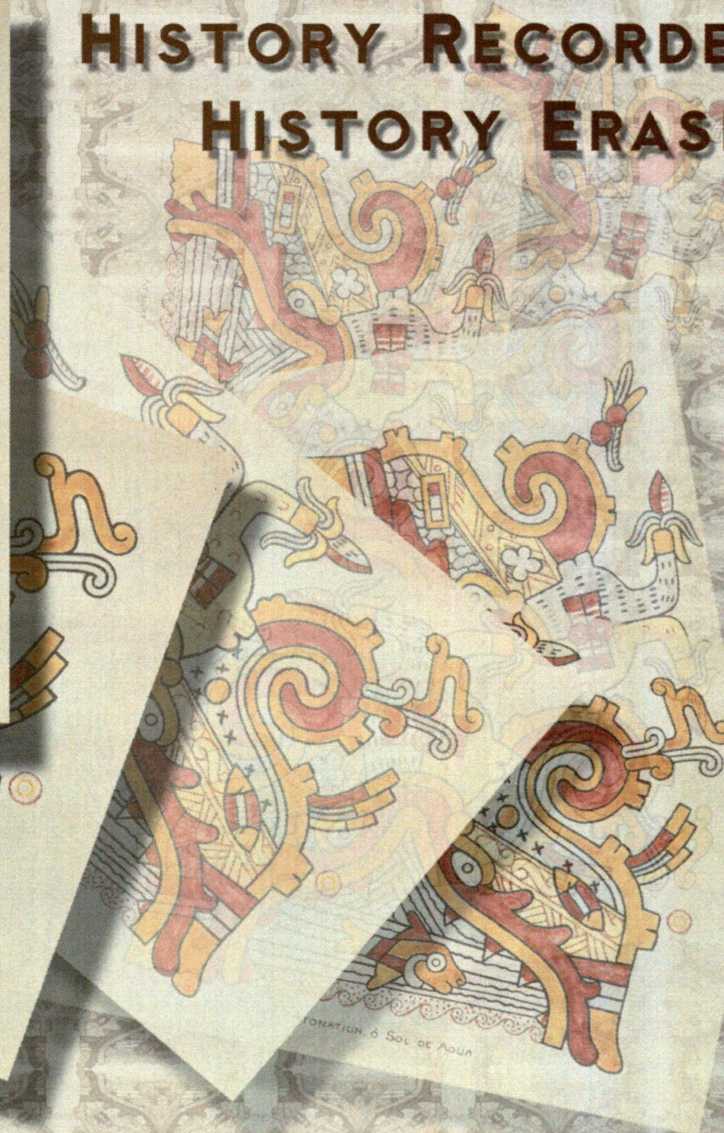
ATONATIUH, ó SOL DE AGUA.

Herzstein Latin American Reading Room Gallery Spring Semester 2004