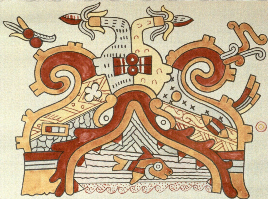
ATONATIUH, ó SOL DE AGUA.