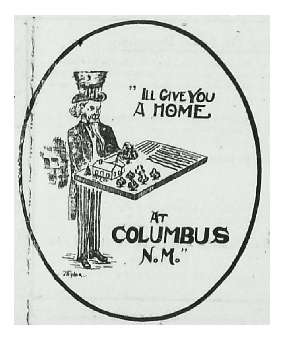
Figure 5.1: Columbus Courier, 30 June 1911

Two of the main reasons that agriculture was a central element of the place myth surrounding desert land in southern New Mexico can be connected back to white, American values. First, boosters sought to make good on the myth of the garden that was one of the most prominent place images connected to the American West in the late nineteenth and early twentieth centuries. This was the idea that American industry could cause "rain to follow the plow," and desert areas to "blossom as a rose." Indeed, Mormon colonists in northern Chihuahua, a group of people familiar to Columbus boosters and residents, had done just that in their settlements near La Ascención and Casas Grandes.