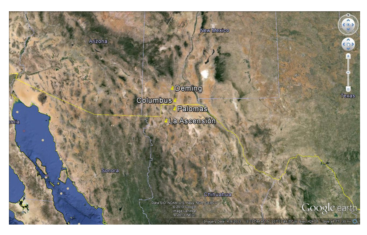
Figure 1.3: Google Earth map of modern Lower Mimbres Valley in the context of the larger U.S.-Mexico border region