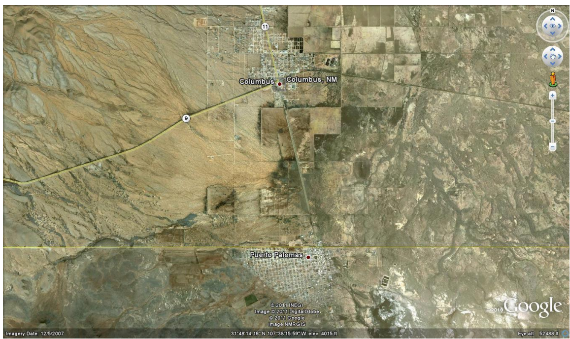
Figure 1.1: Google Earth map of Columbus and Palomas, created 14 July 2011

Douglas-Agua Prieta. This geographic gap in coverage is also present in the historical literature of the Mexican Revolution and geographers' studies of the area. This oversight is most likely due to Columbus' and Palomas' present-day miniscule size and economic insignificance. Yet, I argue that the seeming triviality of these towns that makes them worthy of study.