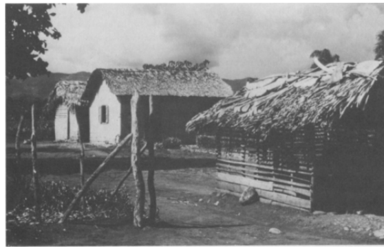
Fig. 5 Dominican Rural House 122

Dominican reformers saw agricultural development as a cure for the “national vices” associated with the cattle raising culture on public lands, typical of the border region. “Unfenced animals, like stateless caudillos, were seen as social parasites preying on the private property and hard work of others. Liberal reformers virulently focused their attack on fencing laws privileging ranchers.” 123 The Reformers’ civilizing campaign was broader; it involved the defamation of an entire way of life, the vilification of the wild-meat hunting and subsistence slash-and-burn agriculture society. As part of the campaign to nationalize the region, “tools, seeds, work animals, and even house furnishings were often provided gratis [to the settlers]. The colony remained tax exempt until such time as it gained its economic feet, and the colonists [received] cash subsidies for an indefinite period of time, at least until their first harvest.” 124 Due to the great dependency farmers had on the State,