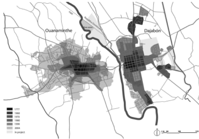
Fig. 3 Growth of Ouanamithe and Dajabón from 1777 an 2004 118

town still follows the traditional grid and urban sprawl which is not as evident as it is in Ouanamithe where only the center of the city is set on a squared pattern.