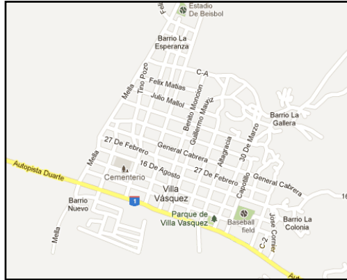
Figure 1 Map of Villa Vázquez 2013 105

The immigration program during the government of Horacio Vázquez, except for Villa Vázquez, was qualified as a failure. The State was unable to make the colonies attractive by offering the necessary means for adaptation. A newspaper of the time, referring to European farmers, said: