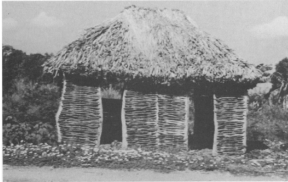
Fig. 4 Haitian Rural House 121

edificios de una arquitectura neoclásica esplendorosa, que se alzaba de las tierras esteparias donde habían vegetado por siglos sus habitantes, para asentarse como un bastión de la espiritualidad de una nueva era dominicanista.” 120