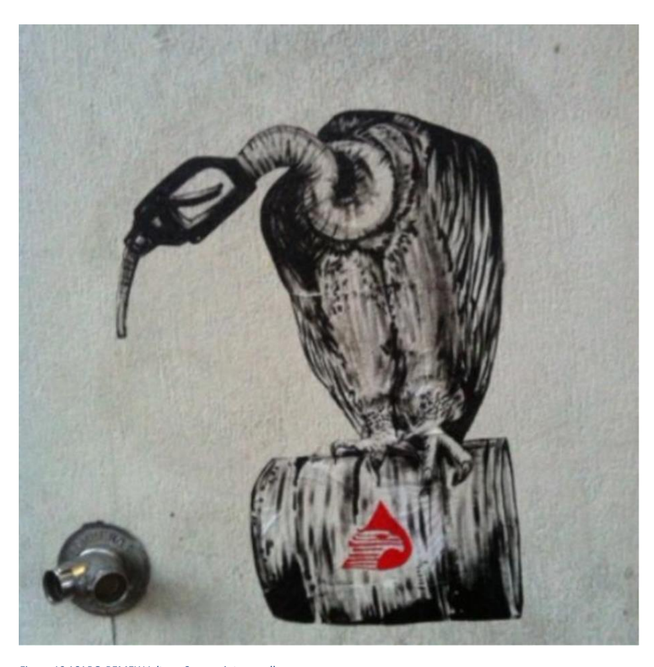
Figure 10 ASARO PEMEX Vulture. Spraypaint on wall