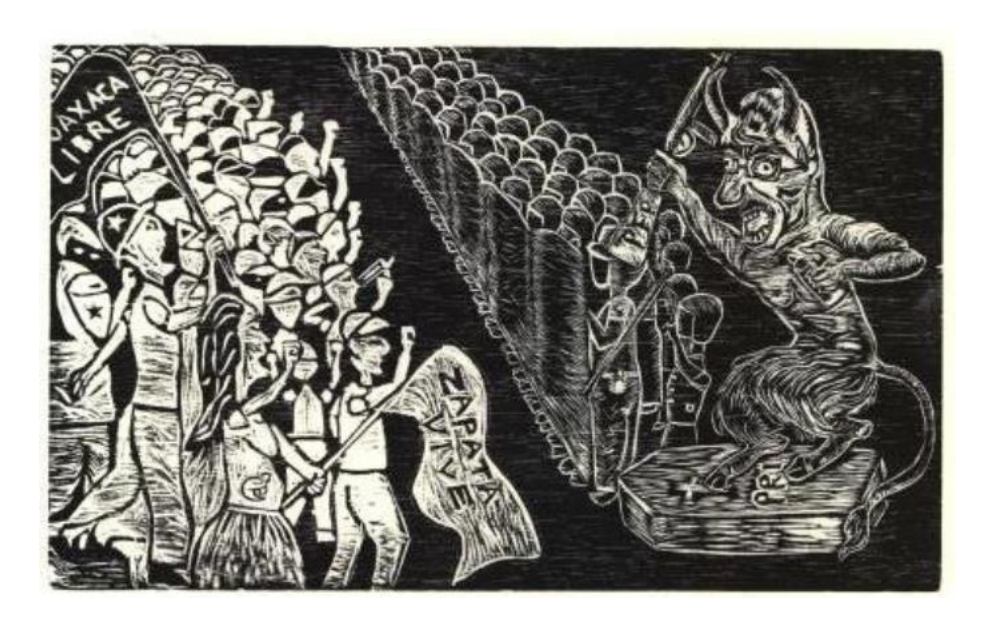
Figure 4 ASARO Oaxaca Libre, Zapata Vive, Woodblock print