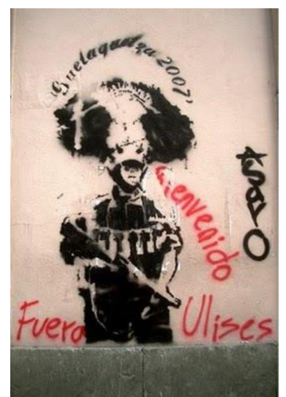
Figure 1 ASARO Dazante de la Pluma with Rifle