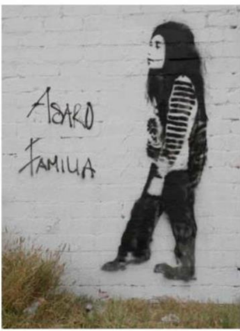
Figure 7 ASARO Women Diptych, wheat paste (left) stencil (right)