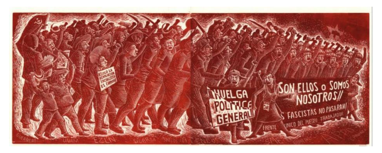
Figure 3 ASARO Son Ellos o Somos Nosotros. woodblock print