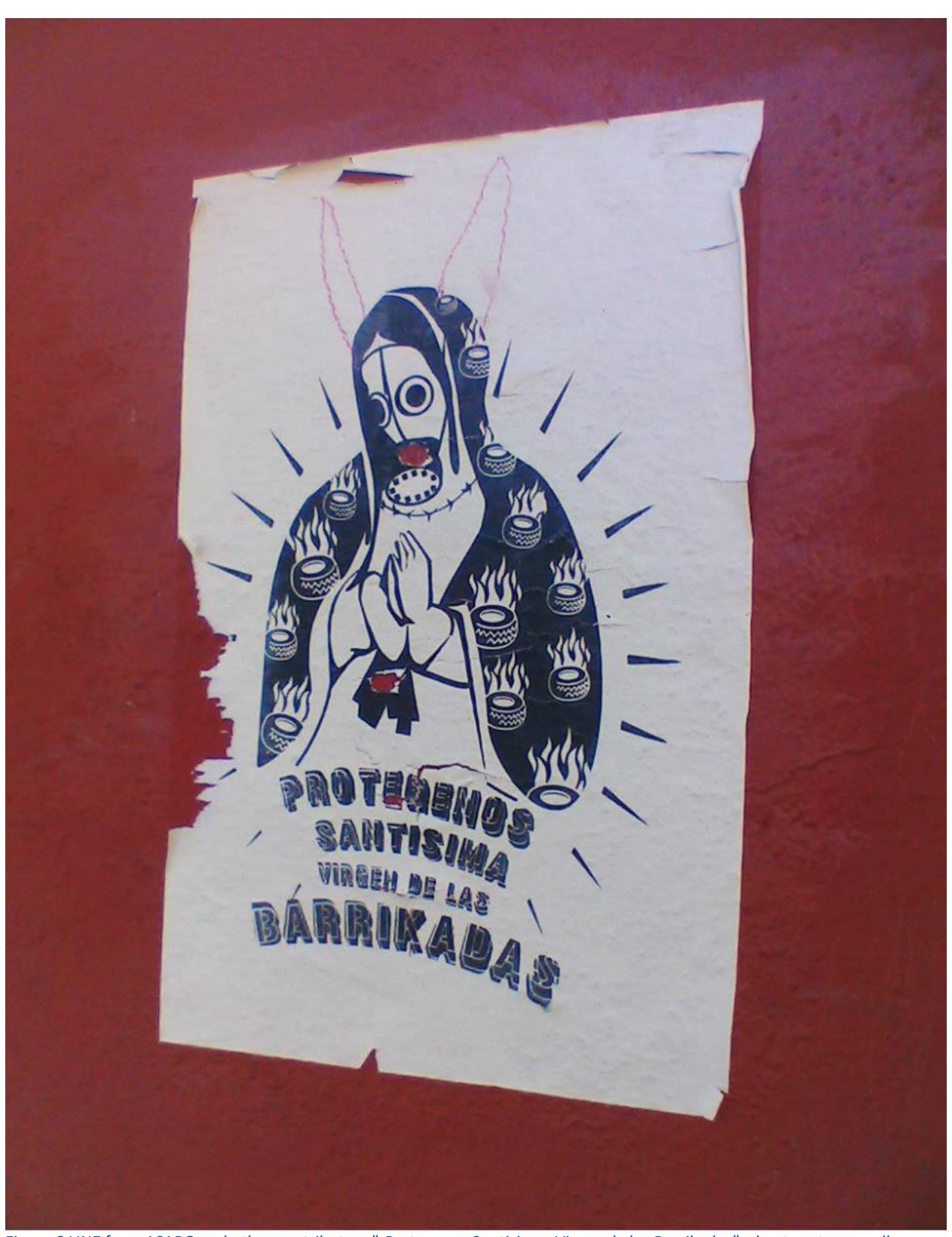
Figure 6 LINE from ASARO and other contributors." Protegenos Santisisma Virgen de las Barrikadas" wheat paste on wall