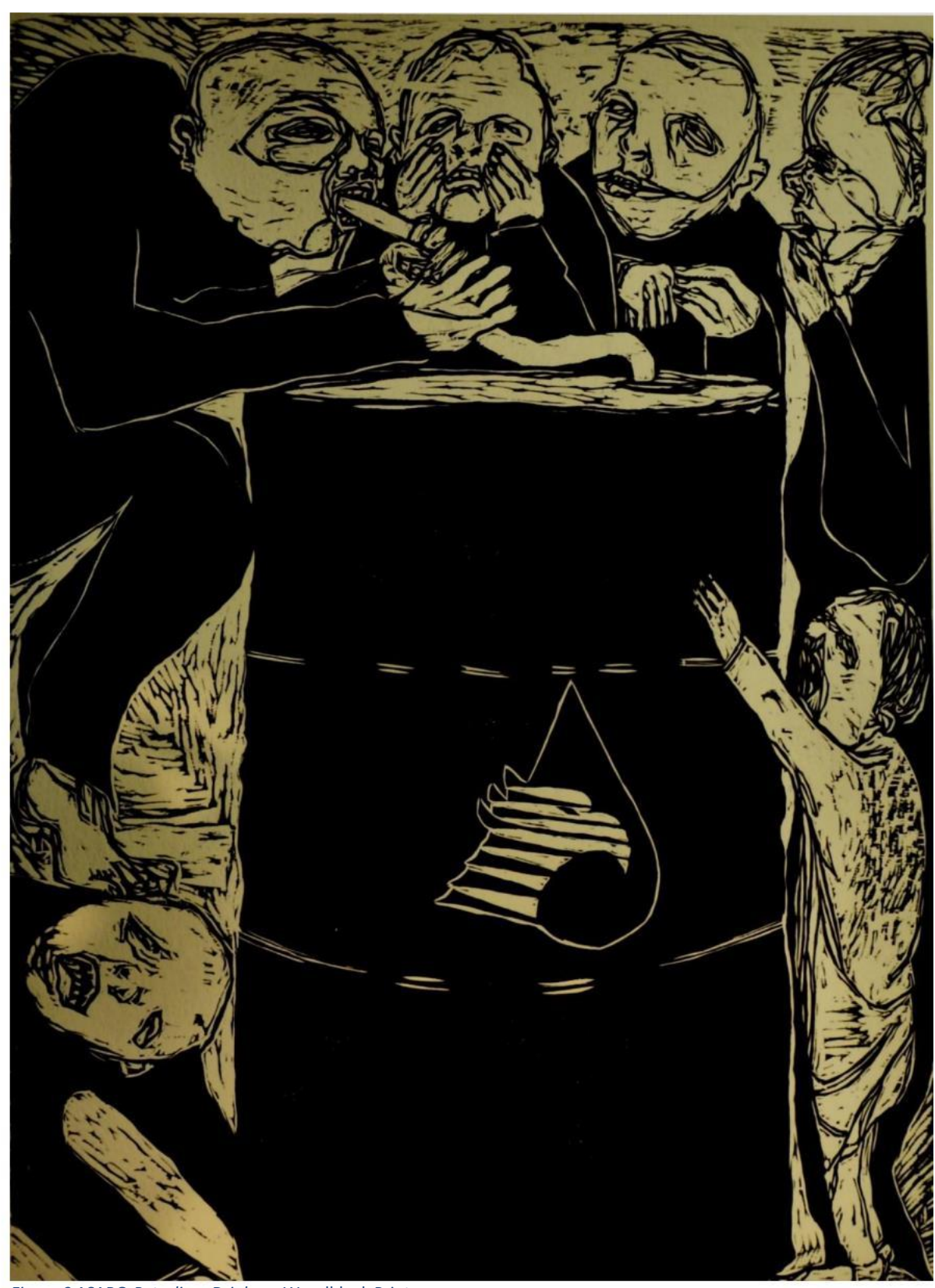
Figure 9 ASARO Petrolium Drinkers. Woodblock Print