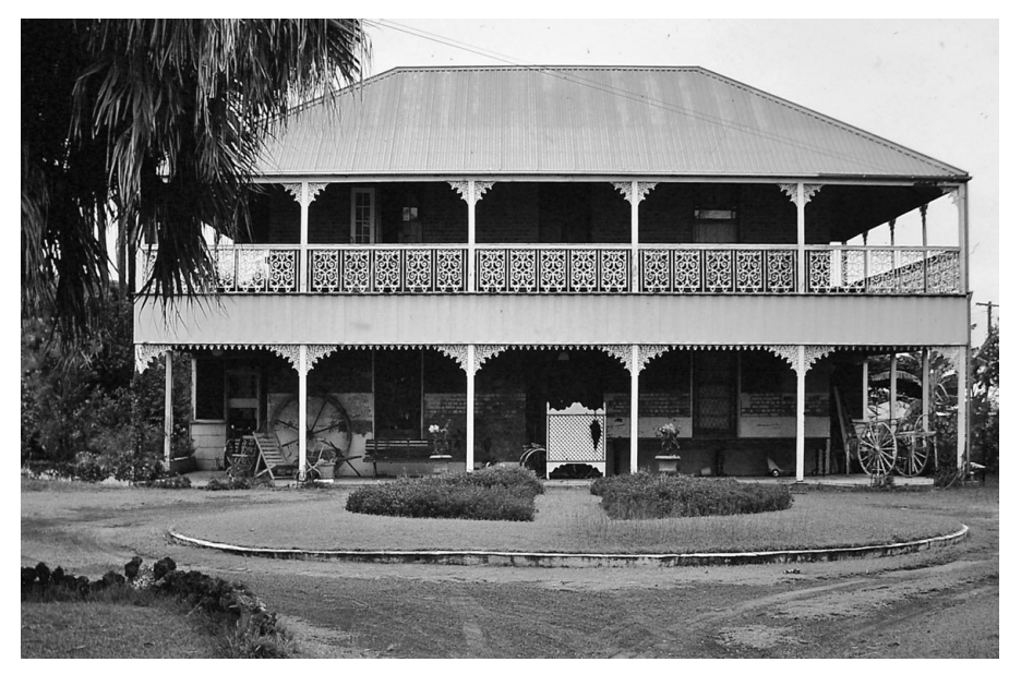
Eskdale, 2011.

1865 brick-built National School. Backhouse's school was built just before outside studding transformed timber construction. Backhouse opened a branch office at Maryborough, perhaps in time to oversee the completion of Eskdale .