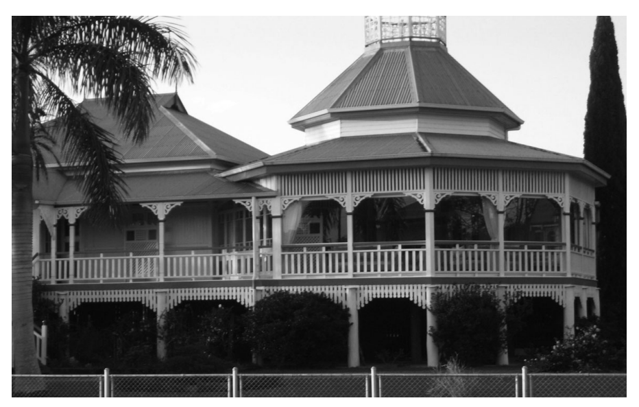
Glenolive, 5 Churchill Street, 2011.