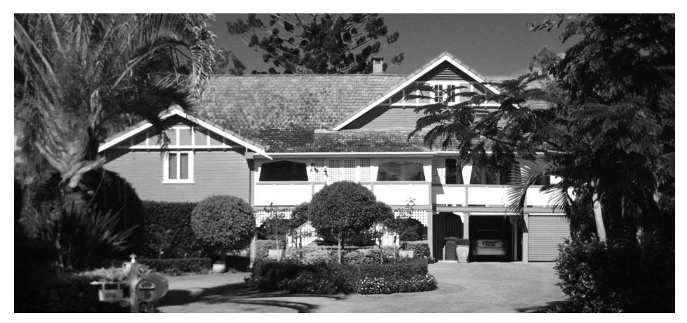
9 Elizabeth Street, 2011.

tenderer was Marbarete Co from Brisbane for brick, 111 with a terracotta tiled roof. It combines elements of the Californian bungalow with arts and crafts and came complete with sculptured kookaburras perched on ledges to the chimney shaft.