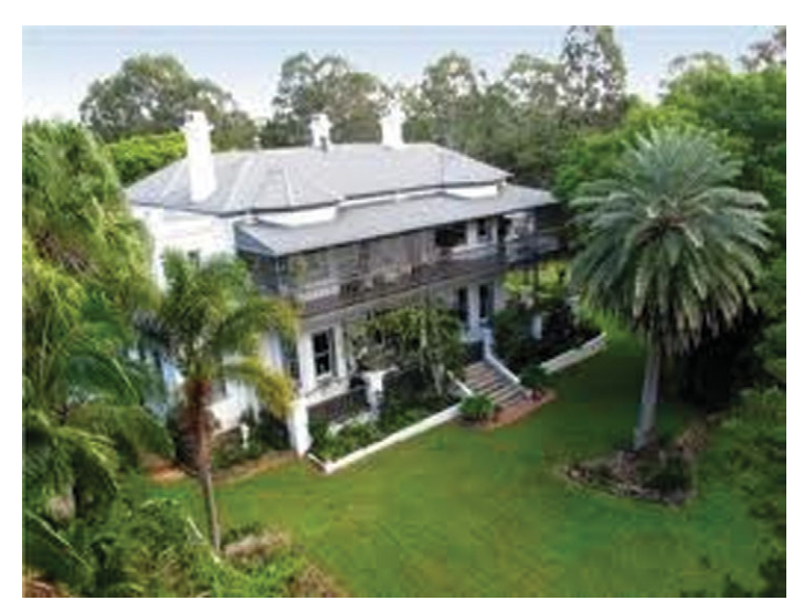
(Colour online) Baddow House.