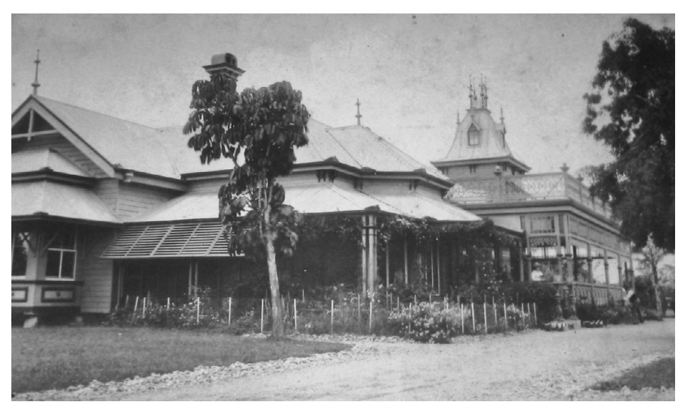
Doon Villa, 2011.