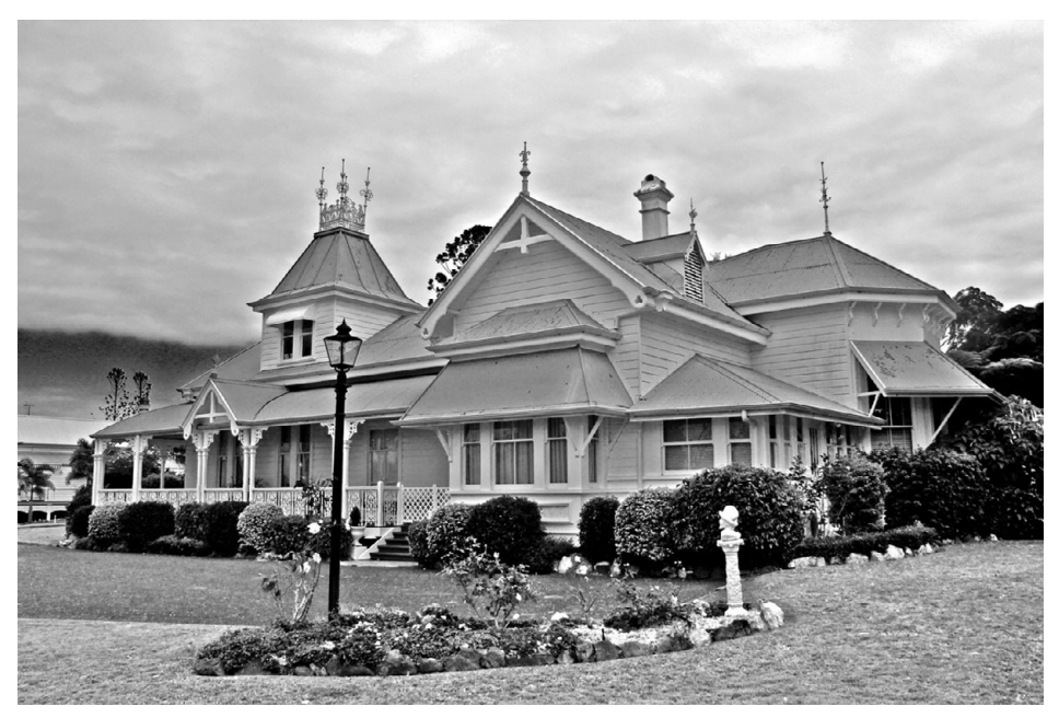
Ilfracombe, 2011.

success. In the mid-1890s, Maryborough was the undesignated 'chrysanthemum capital' of Queensland.