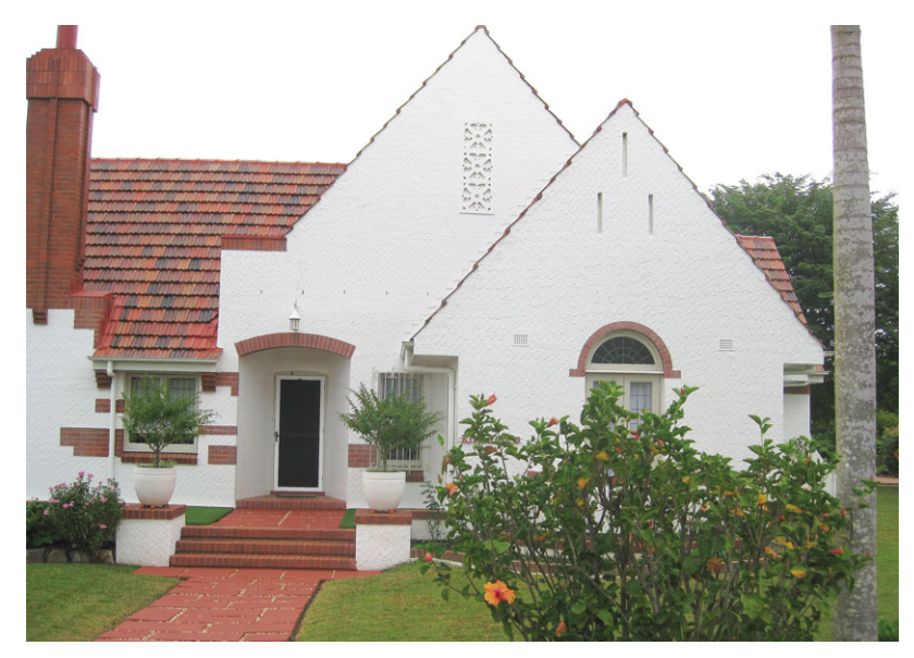
(Colour online) Riverview, 2011. Courtesy Glenn R. Cooke

Maryborough relatively few new houses were required. The huffing and puffing of a big bad wolf was not necessary to blow houses of sticks away. The clearing of the pine scrubs and hardwood forests achieved the same result, if taking much longer. In another gradual way, the houses were also disappearing. Almost from the time timber houses in Queensland are finished, there is a progressive and seemingly inevitable loss of material as timber details are simplified or removed when maintenance is carried out. Some detail is reinvented, mostly in stereotypical form, but more often it has gone for good – followed often enough by the all too easily demolished timber buildings themselves. They are a legacy to be treasured.