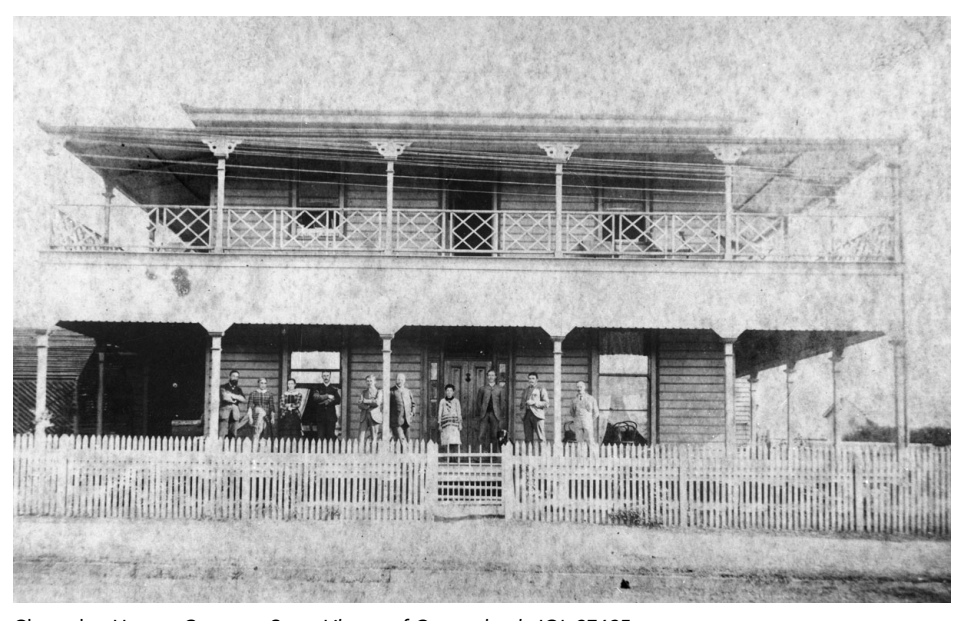
Clarendon House.

lot (dating from the Maryborough Club) is more elaborate than Stanley's simple original.