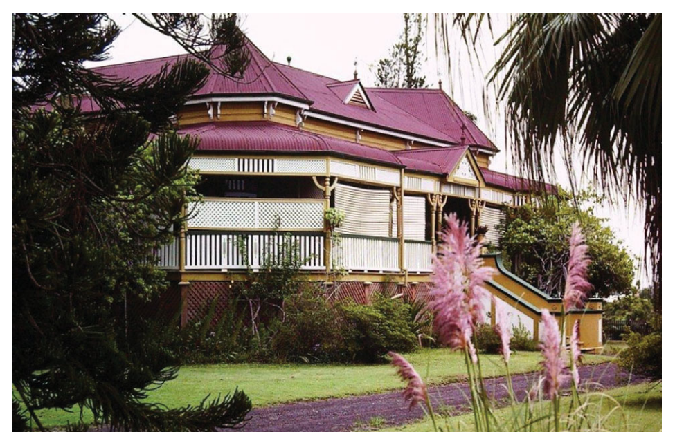
(Colour online) Oonooraba, 2011.