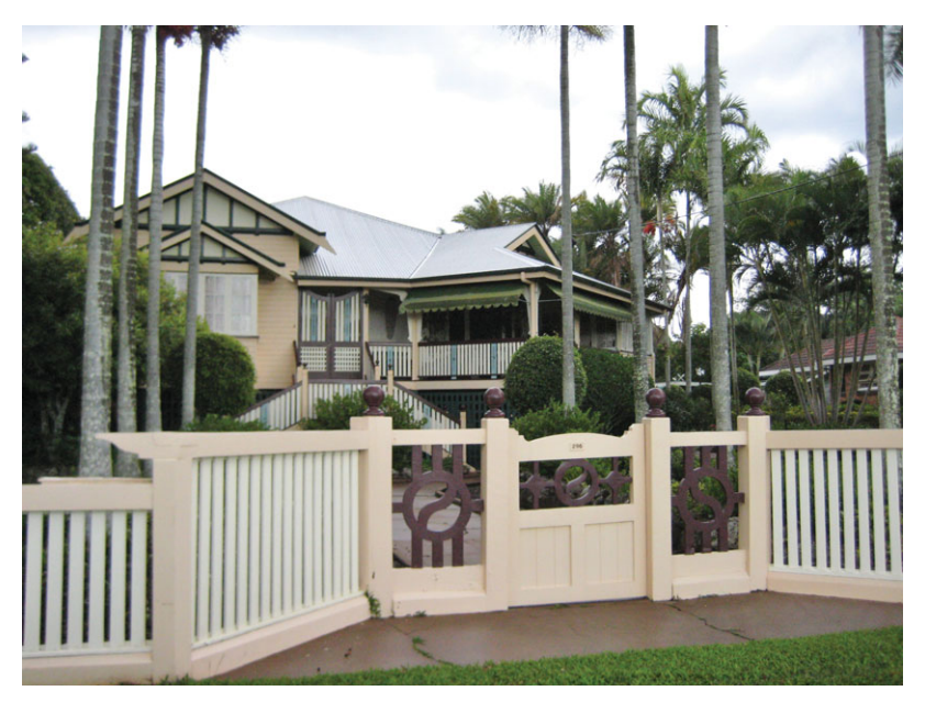
(Colour online) 296 Lennox Street, 2011.