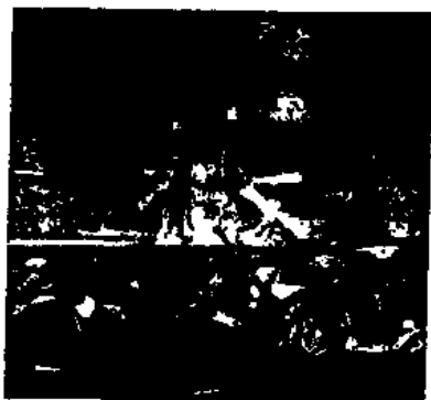
* The Victoria and Albert Museum, London, England