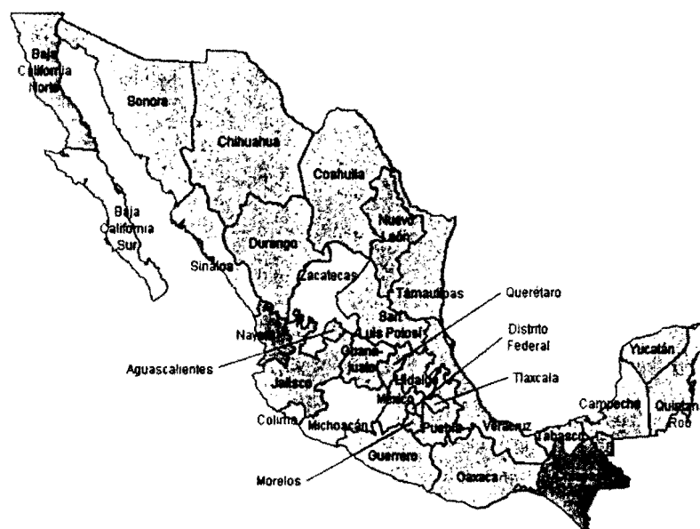
Figure 2. Map of the States of Mexico

All of the participants reported coming from small towns. Their time here in the United States ranges from sixteen to thirty-three years. None of the participants, therefore, would be described as recent immigrants. All of the participants self-reported as growing up “poor.” Additionally, some of the participants describe their current economic situation as being “poor.” To verify this information, I asked participants whether their children receive free or reduced lunch and breakfast at school. All of the participants said that their children received either free or reduced lunch and breakfast at school. In order to verify this data, I would need to get the student identification numbers for each of the participants’ children and then cross check with student records at