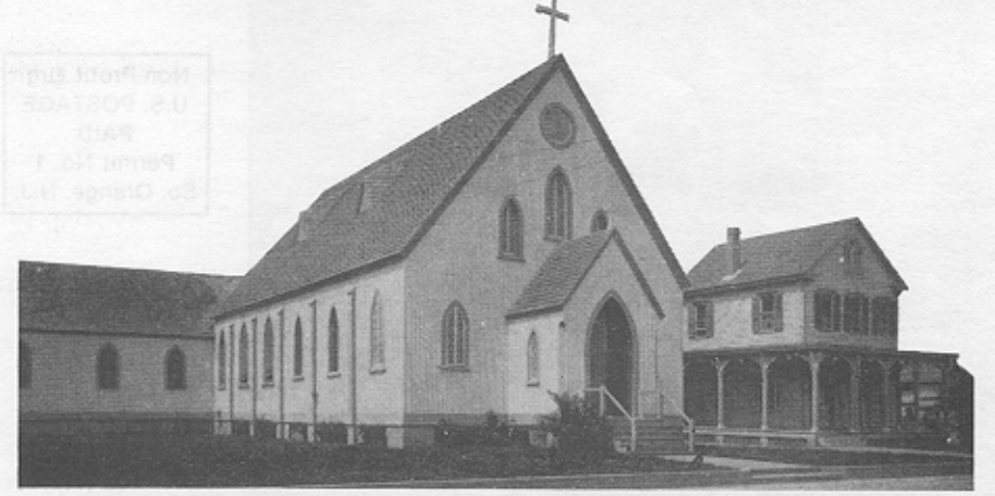
The first Catholic church in Cape May, St. Mary's and its companion rectory. The small wooden building served the community from 1848 to 1913.

If your volume is unique, please contact us at the above address and we will attempt to arrange for some form of duplication. Help us permanently record your church's development and make the record available to scholars.