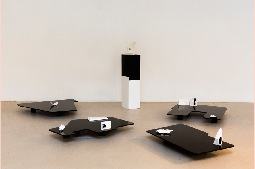
On Moving Farther Away from Speech, or Hindsight is Never Twenty/Twenty ceramic, plaster, wood, resin and digital photograph dimensions variable 2014