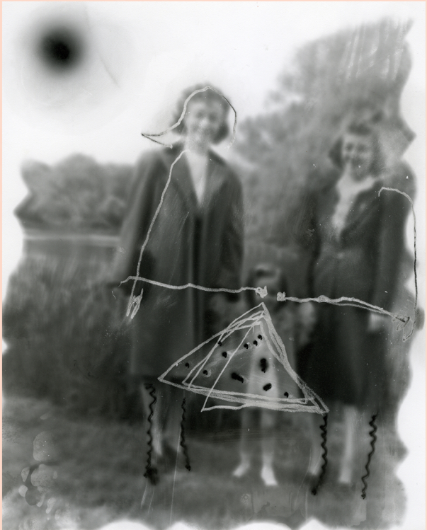
Daughter unique silver gelatin print 10" x 8" 2006