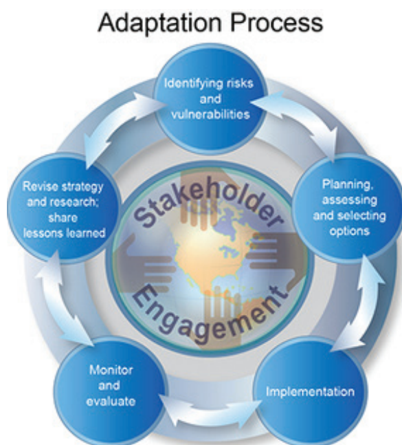
Figure 2. National Climate Change Assessment's adaptation process Source: Bierbaum et al. (2014)

In addition to addressing these concerns, the Forest Service is also considering how climate change might affect the whitebark pine. In the Range-Wide Restoration Strategy for Whitebark Pine , Keane et al. (2012: 38) state: "In anticipation of climate change, transfer of rust resistant seed sources should be unidirectional from colder (northerly latitude, higher elevations, or both) to milder climates within the local temperature envelope and seed zone." One possible management option, according to the US Forest Service, is assisted tree migration, namely moving tree species to non-native habitats. Stein et al. (2014) call assisted migration a "climate-smart design consideration." They also acknowledge that existing forest management policies need to be changed and that the policy environment needs to be accounted for.