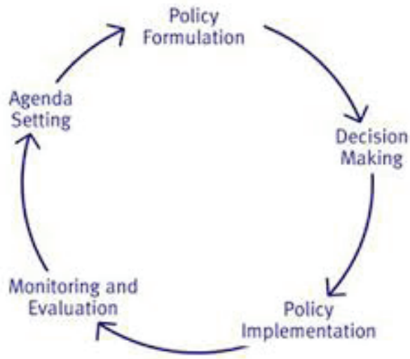
Figure 1 – The Policy Cycle

also concerned with the ability of government agencies to respond to change (Weiss 1998), the intellectual and organizational resources of the state (Cummings and Nørgaard 2004), knowledge management and organizational learning (Common 2006), or policy formulation (Goetz and Wollmann 2001).