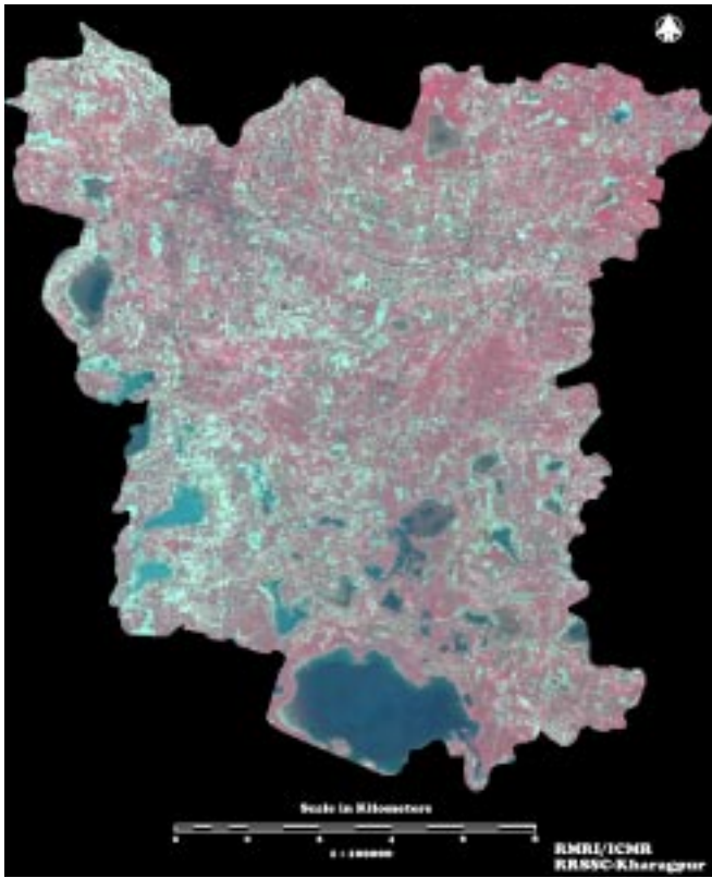
Fig. 1: False colour composite (FCC) of Patepur block, Vaishali district, Bihar

Correlation of sandfly population with spatial changes in landuse/landcover variables: The changes in sandflies density were analysed with seasons. Seasonal trend analysis of adult population density was correlated with eco-environmental parameters to understand influence of specific parameters, if any. Sandfly population changes were analysed with three main variables namely vegetation, water bodies and settlements. As vegetation and human settlements support the thriving of adult population by providing food and shelter, the adult densities were correlated with spatial changes in vegetation cover and human settlements.