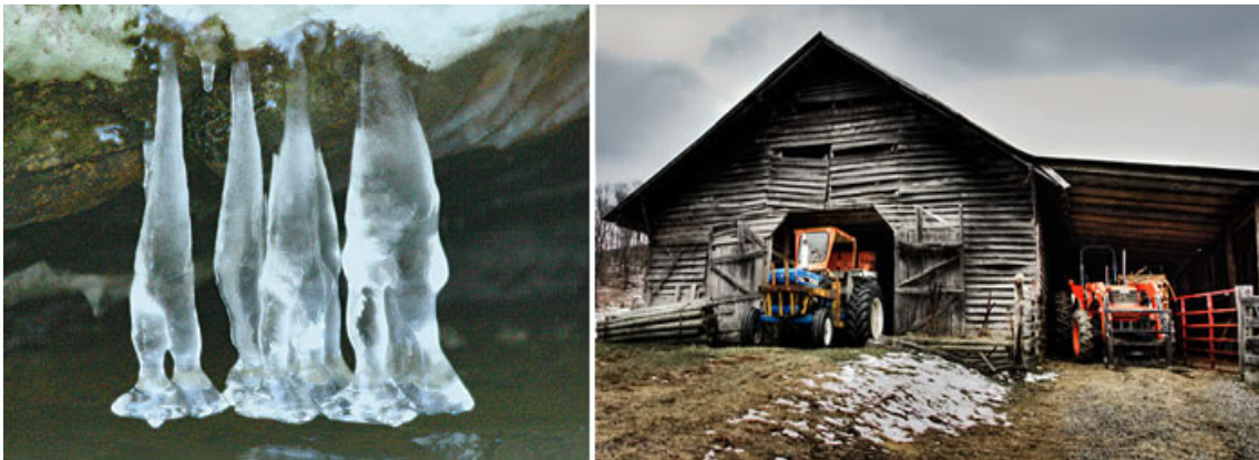
Image 14: Fred First (" The Iceman Cometh "; " Visiting the Neighbors ").

Getting out of the car at the home we were visiting, I was struck by the radiant light from the two tractors waiting patiently in the monochrome barn. They seemed almost alive, animated cartoon machinery granting a splash of otherworldly color on the grayest of early winter days. (" Visiting ")