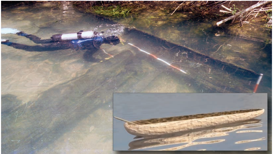
Figure 2. Documenting a Roman logboat from 1st cent. AD in the river Ljubljana at Vrhnika. Bottom right: Reconstruction of a Vučedol culture logboat from c. 2800 BC by Predrag Petrovič, ArtRebel9 Ltd. from Ljubljana

one of the highest in Europe, if not absolutely the highest (Fig. 1). Among the finds are 5 boats/ships with a flat bottom, suitable for shallow water navigation, 76 logboats and numerous oars and boat models.