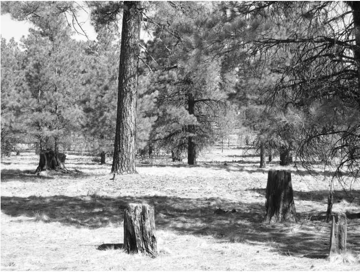
Figure 1. Examples of stumps (foreground, and to the left of the large tree), indicative of historical tree locations, and a live tree of pre-settlement origin (left-center).  in 2009, Forest Road 3E, Coconino National Forest, northern Arizona (UTM: 440,918 m E, 3,885,850 m N, North American Datum 1983).

pine forests. The goal of thinning is not necessarily to replicate historical conditions (prior to late 1800s Euro-American settlement), but rather to reduce tree densities to levels that support surface fires instead of crown fires (Covington 2003). As a result, knowledge of the historical forest structure can help with the planning of thinning projects by providing estimates of tree densities that were sustainable through at least several generations of trees (Allen and others 2002).